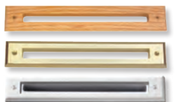
Slotted outlet for sidewall applications (available in a variety of finishes and wood species)