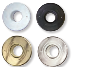
5" outer diameter plastic outlet for ceiling applications (available in white, black, brass, chrome or custom paint finishes)

A huge selection in outlet choices is available. Our outlets come round or slotted, and are designed to fit any decor or home architecture without compromise.