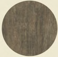
WF409 Ranch Gate