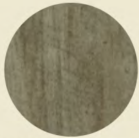
WF418 Bark Mherge