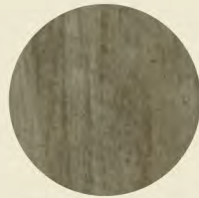
WF418 Bark Mherge