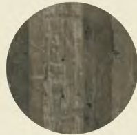
WF421 Loft Reclamation Maple