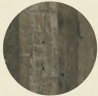
WF421 Loft Reclamation Maple