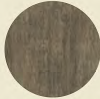
WF409 Ranch Gate