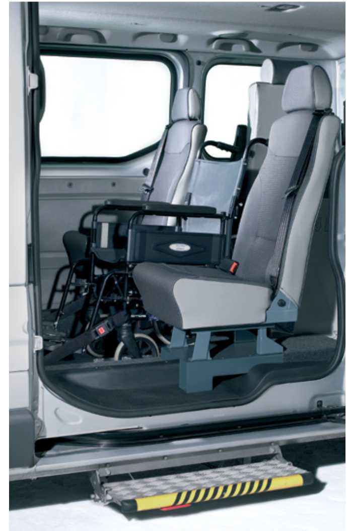
Side step allows easier access to the vehicle