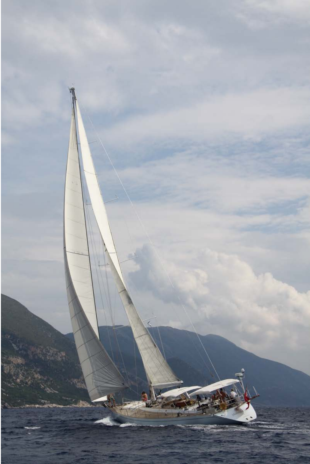
Baltic Maxi 80