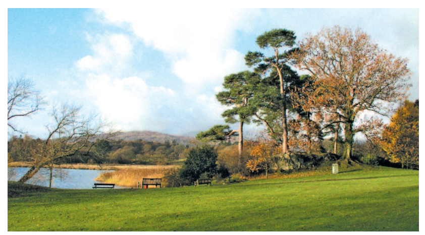
Borrans Park - P. Southall