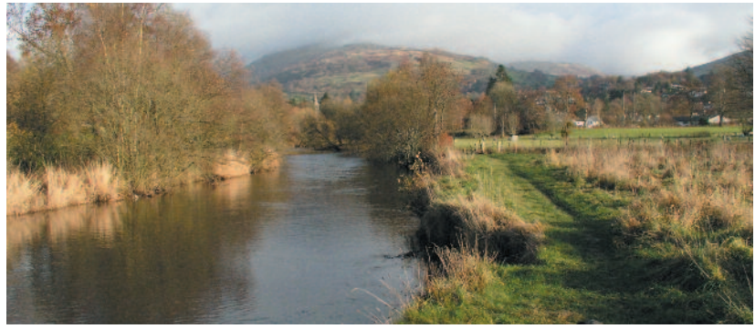
River Rothay - P. Southall

Council and, although it is only for a short distance, it is delightful to walk by the small sandy beaches, reed beds and picnic sites. Walk around but before the path leaves the park, cut across the grass to the gate and enter Galava, Ambleside Roman Fort - see page 37.