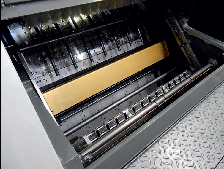
End of press lamp on Komori LS29

Benford's new ecoUV TM curing systems open up a whole new range of benefits to printers that were only available with a full UV press.