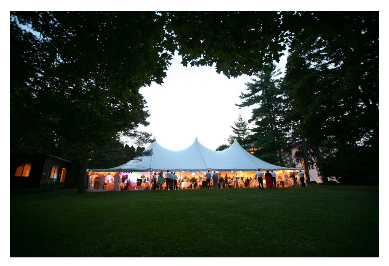
South Lawn Tent Pavilion for dinner parties, weddings and many festive events of up to 150 people.