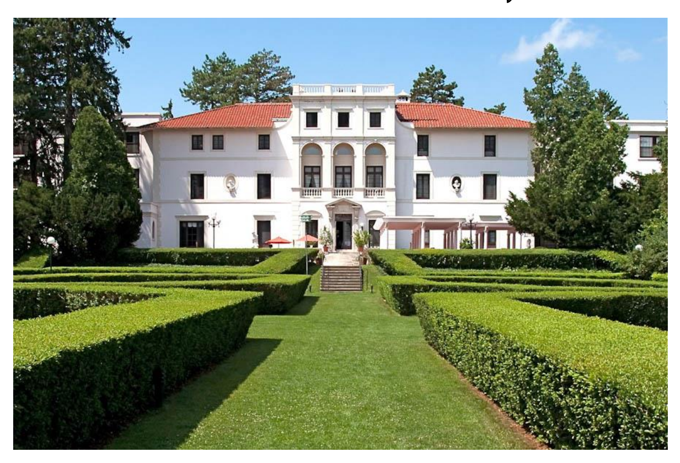
Built in 1910, in the Italian Renaissance style, Geneva On The Lake was modeled after Villa Lancellotti in Frascati, Italy which was built in 1592. It was the Lancellotti Family's summer retreat about 15 miles from Rome.