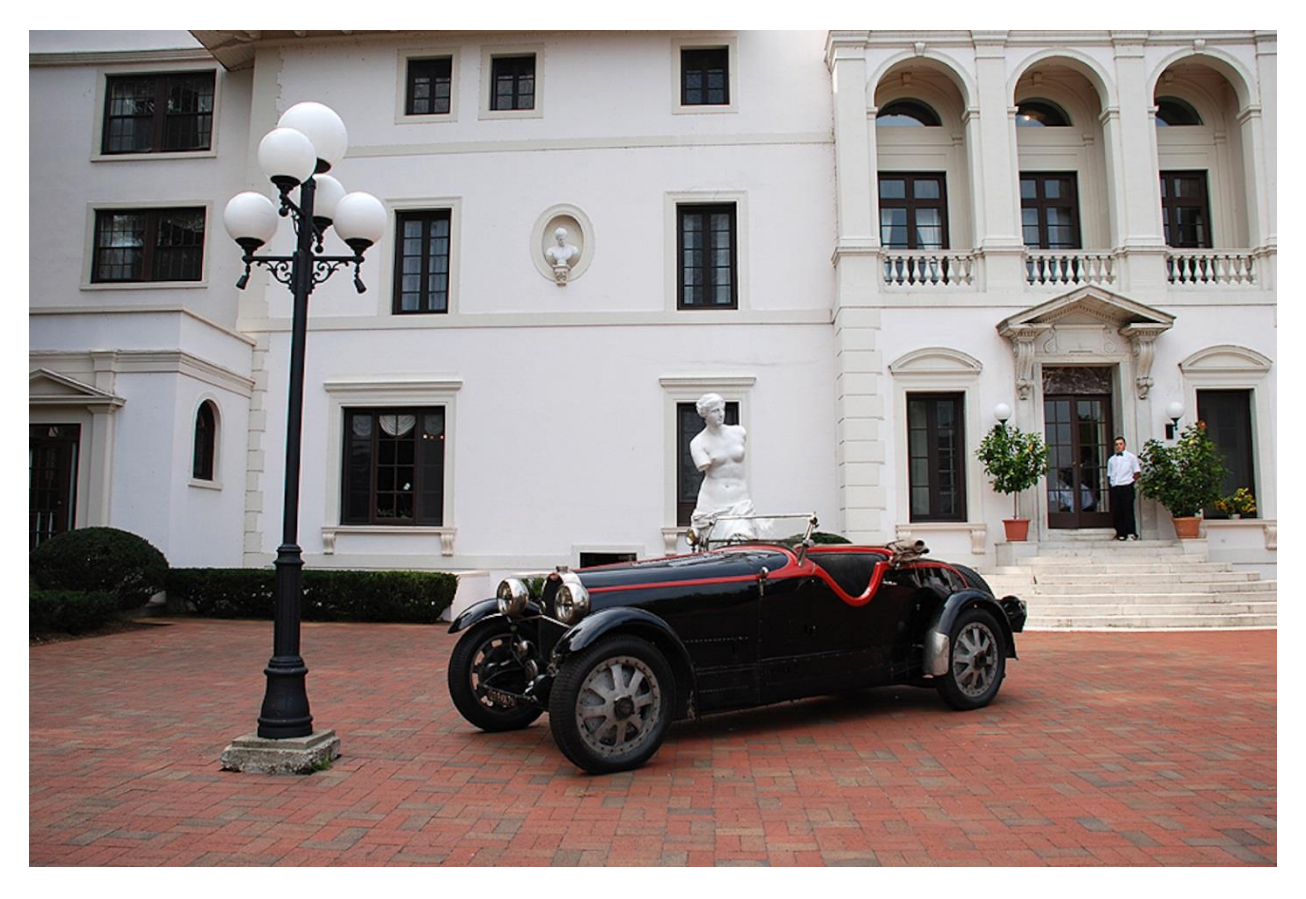
The Terrace for cocktails, receptions and al fresco dining has a cast of the original Venus de Milo in The Louvre .