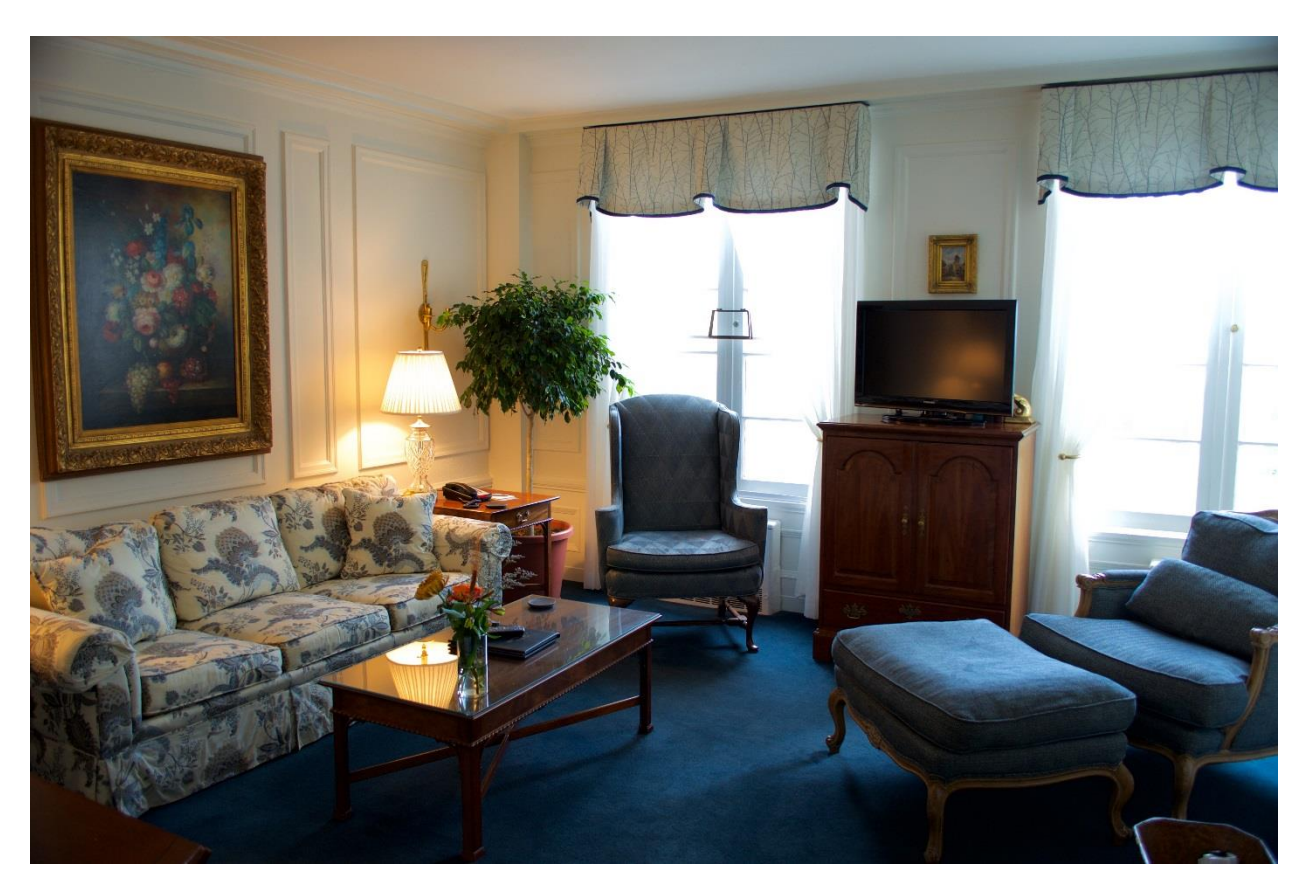
The living room of the "Classic Suite" with a center view overlooking the gardens. The resort has 29 Stickley furnished accommodations each uniquely appointed (10 suites have two bedrooms).