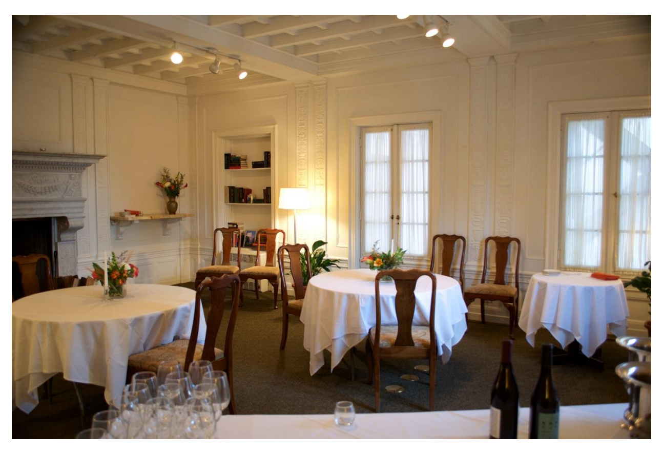
A beautiful room with wood burning fireplace and much natural light for small meetings, private dinner parties and wedding receptions of up to about 25 people.