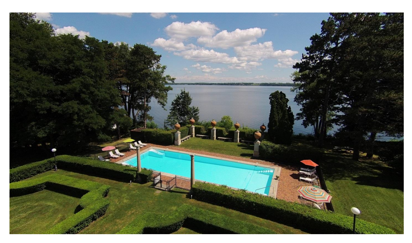
The 70' swimming pool overlooks Seneca Lake which is 37 miles long and 642 feet deep. Seneca Lake is noted for great fishing, especially lake trout, and is at the epicenter of New York State's Finger Lakes Wine Country.