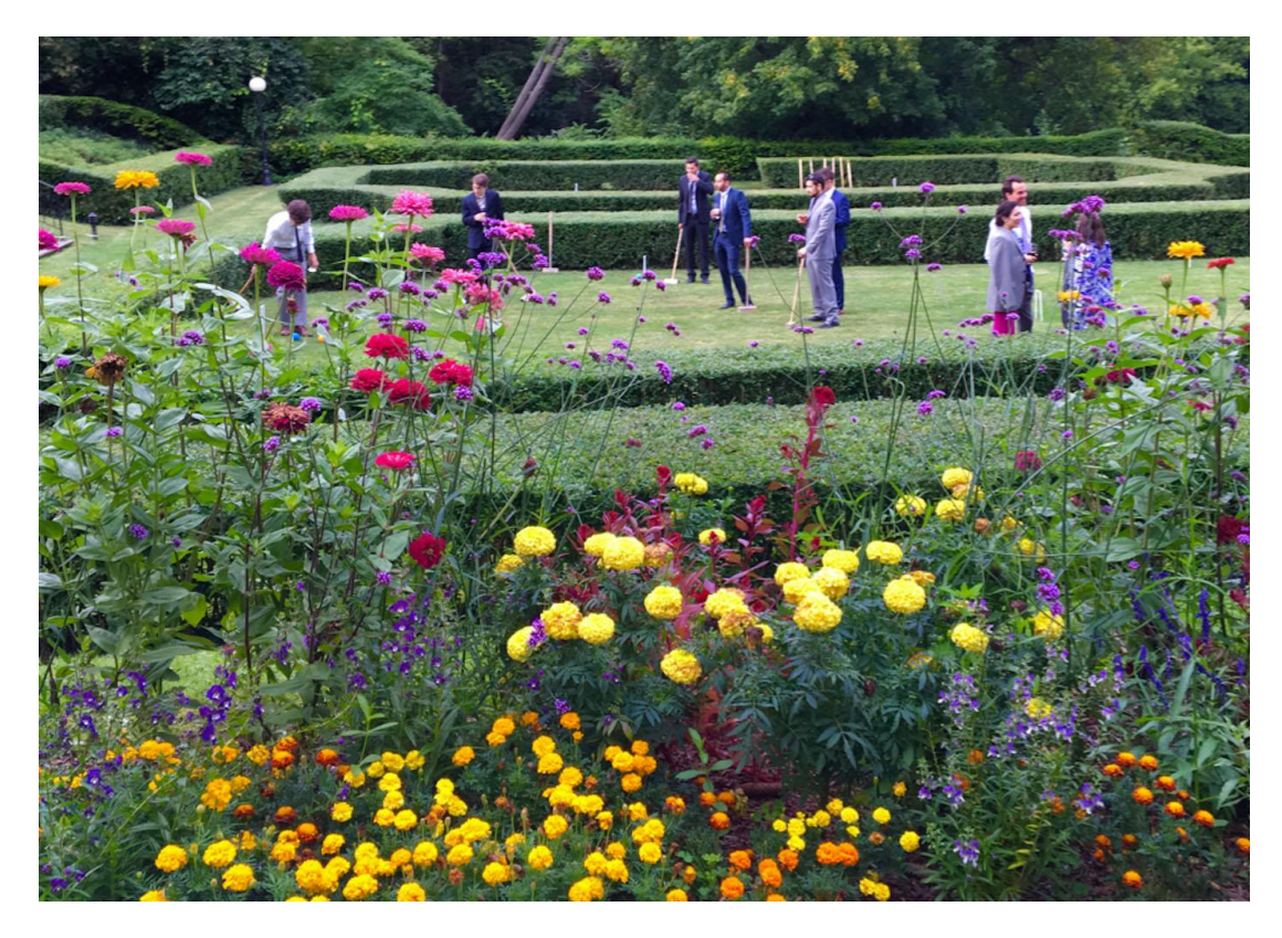
Croquet, bocce, badminton, volleyball, horseshoes, basketball hoop, bicycles and boats at the dock – all on 10 beautiful acres next door to Hobart and William Smith Colleges and Geneva's Historic South Main Street.