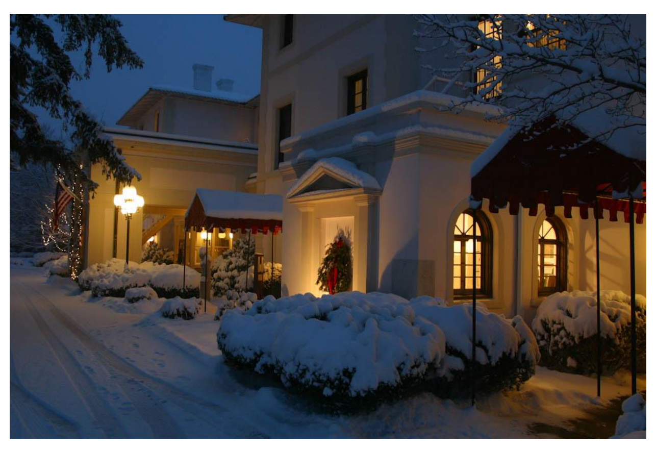
The "warmth of winter" for Christmas, New Years, winter holidays and romantic getaways.