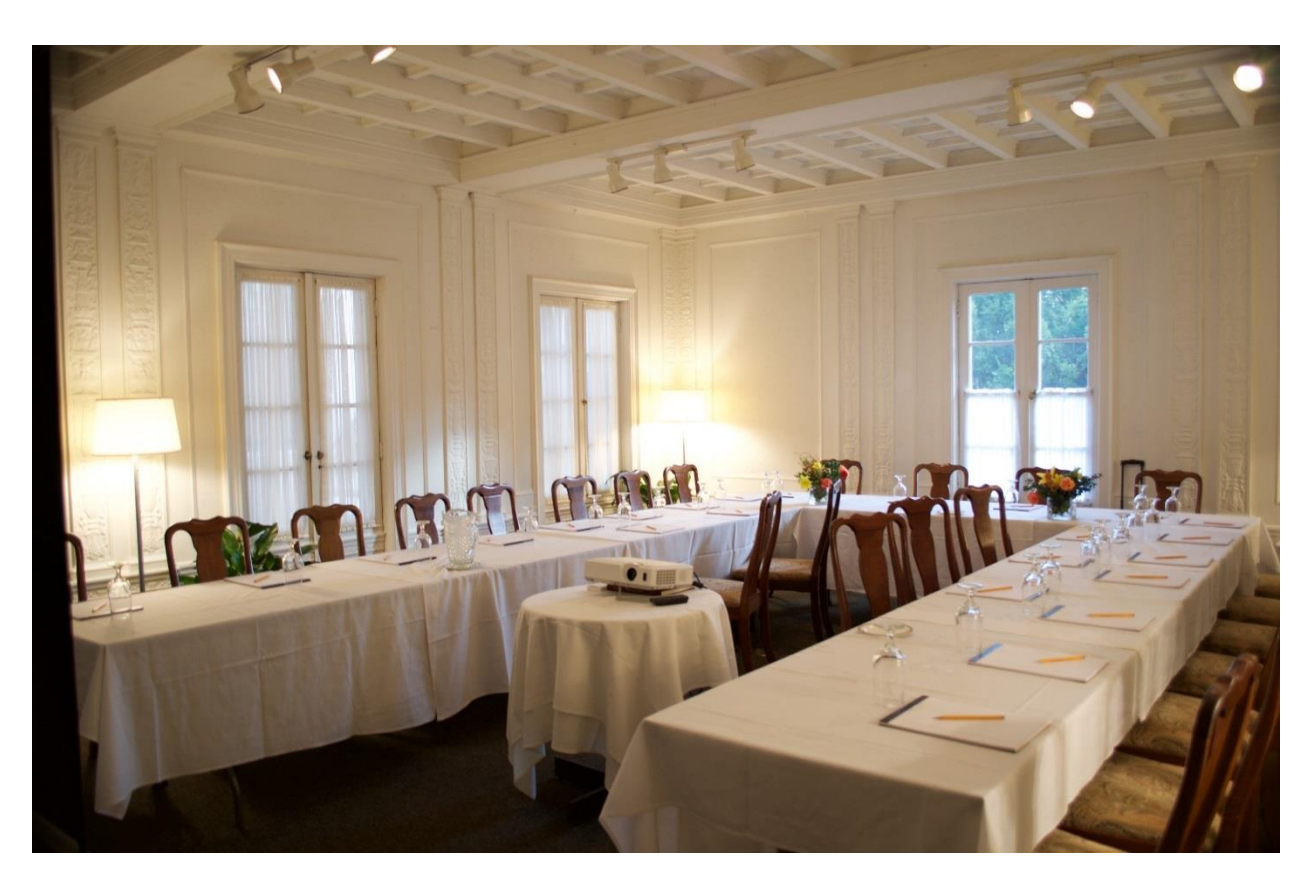
Leonardo da Vinci Conference Suite with High Speed Business Class Internet, WI-FI and an adjoining beverage room. It is just steps away from the Terrace and formal gardens.