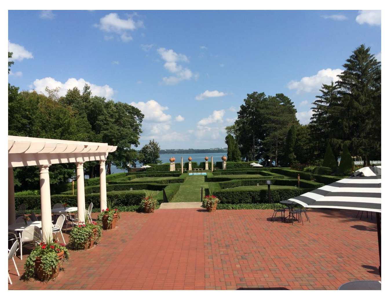
The "lawn furnishings" with a privet hedged formal garden and pool were completed in 1930.