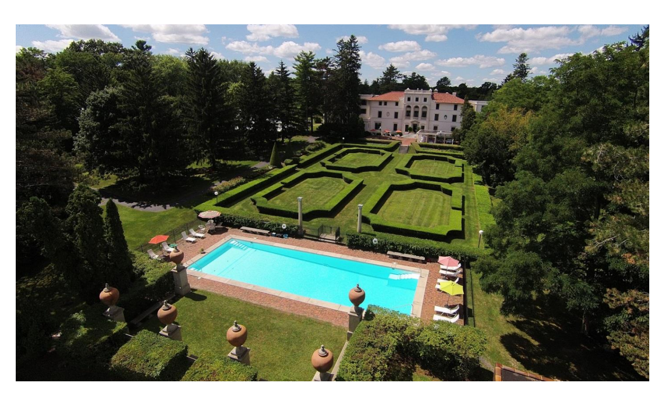
"I next checked into Geneva On The Lake, a grand resort in the lively burg of Geneva. It's an excellent home base, since Geneva's downtown has become the regions restaurant and bar nexus." Travel and Leisure, October 2018