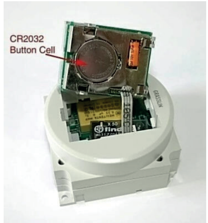
4, Remove CR2032 cell from assembly and fit new button cell

To reassemble reverse the above process.