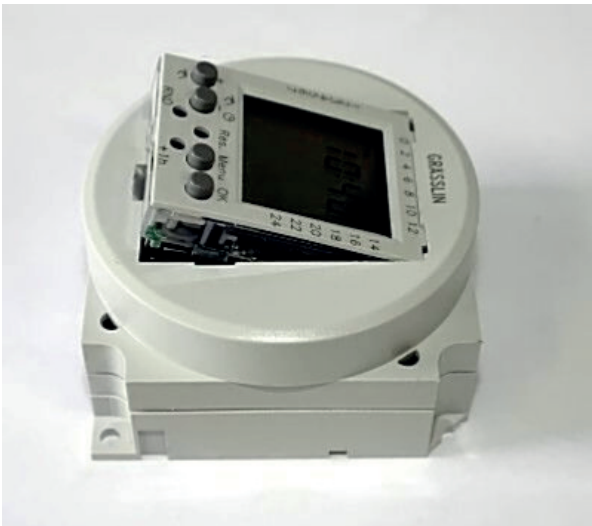
3, Remove timer module taking care not to stress ribbon cable