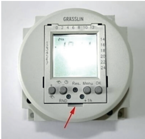
1, Locate Lever point