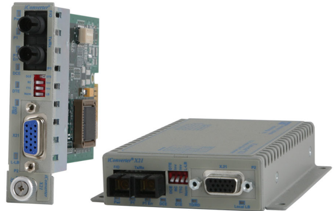
SFP not included

As a standalone unit, the X21 is available as a tabletop or wall-mount unit. The tabletop model can be DIN-rail mounted using an optional DIN-rail mounting kit. Both the tabletop and the wall-mount models are DC powered and are available with an external AC/DC power adapter or a terminal connector for DC power.