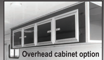
Overhead cabinet option