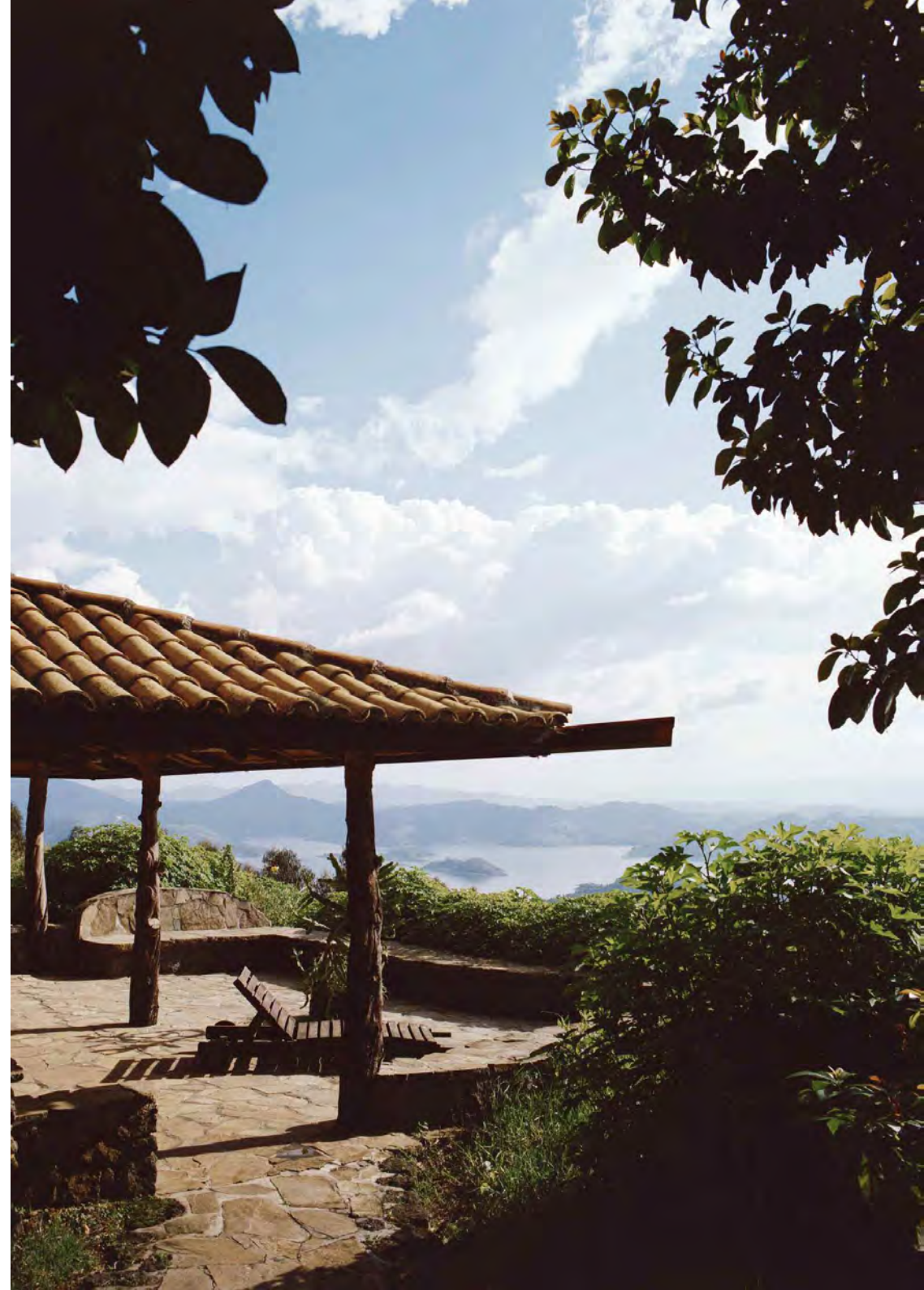
Right: Main sitting room and terraces at Virunga Lodge

Over the years as tourism has opened up, we have progressively upgraded the lodge to accommodate our guests – many of whom are VIPs. The buildings are still local and low impact, in keeping with our eco-principles of using solar power, harvesting our own rain water, recycling where we can and using local materials. We still employ, train and empower local people to be the core workers. Our hospitality is still eco-luxury – remembering where we started, and the fact we share the planet with people far poorer than our guests.