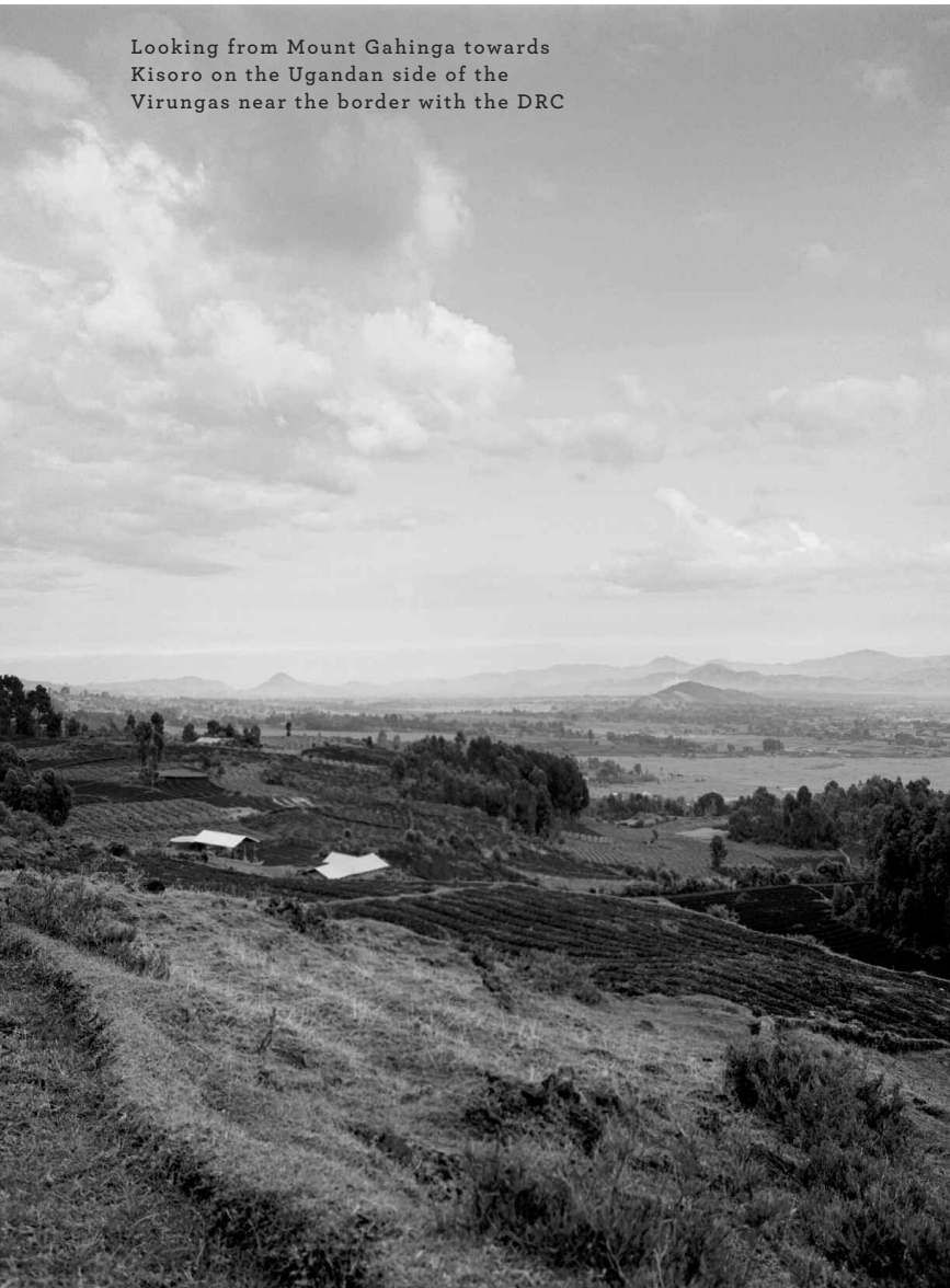
Looking from Mount Gahinga towards Kisoro on the Ugandan side of the Virungas near the border with the DRC