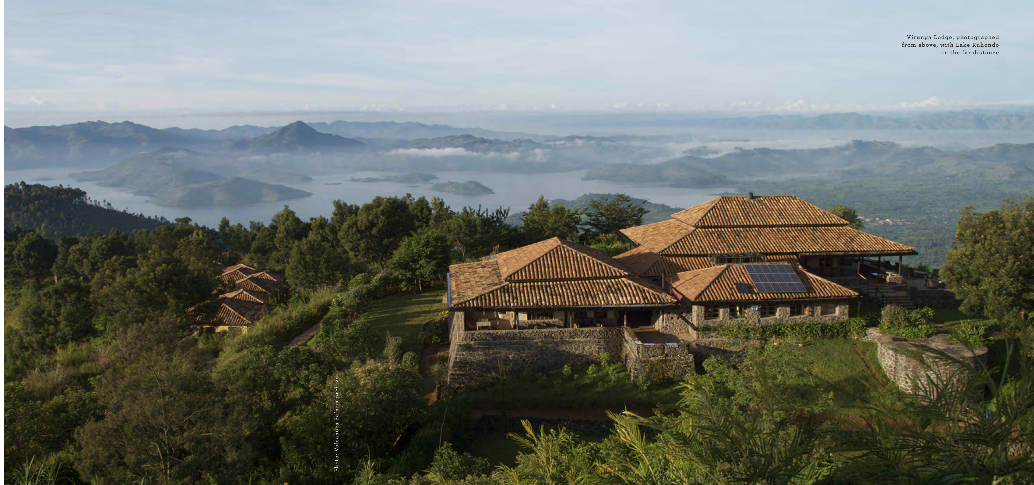
Virunga Lodge, photographed from above, with Lake Ruhondo in the far distance

In June 2004 we opened our first four cottages, or bandas , at Virunga Lodge. They were nothing fancy: large but simple rooms, locally made furniture, local kitenge cloth curtains, hurricane lamps, with very basic bathrooms (since getting water was a big issue, we had dry toilets and bush showers). But still, it was a very grand project on a very grand site while people around us were still struggling to survive.