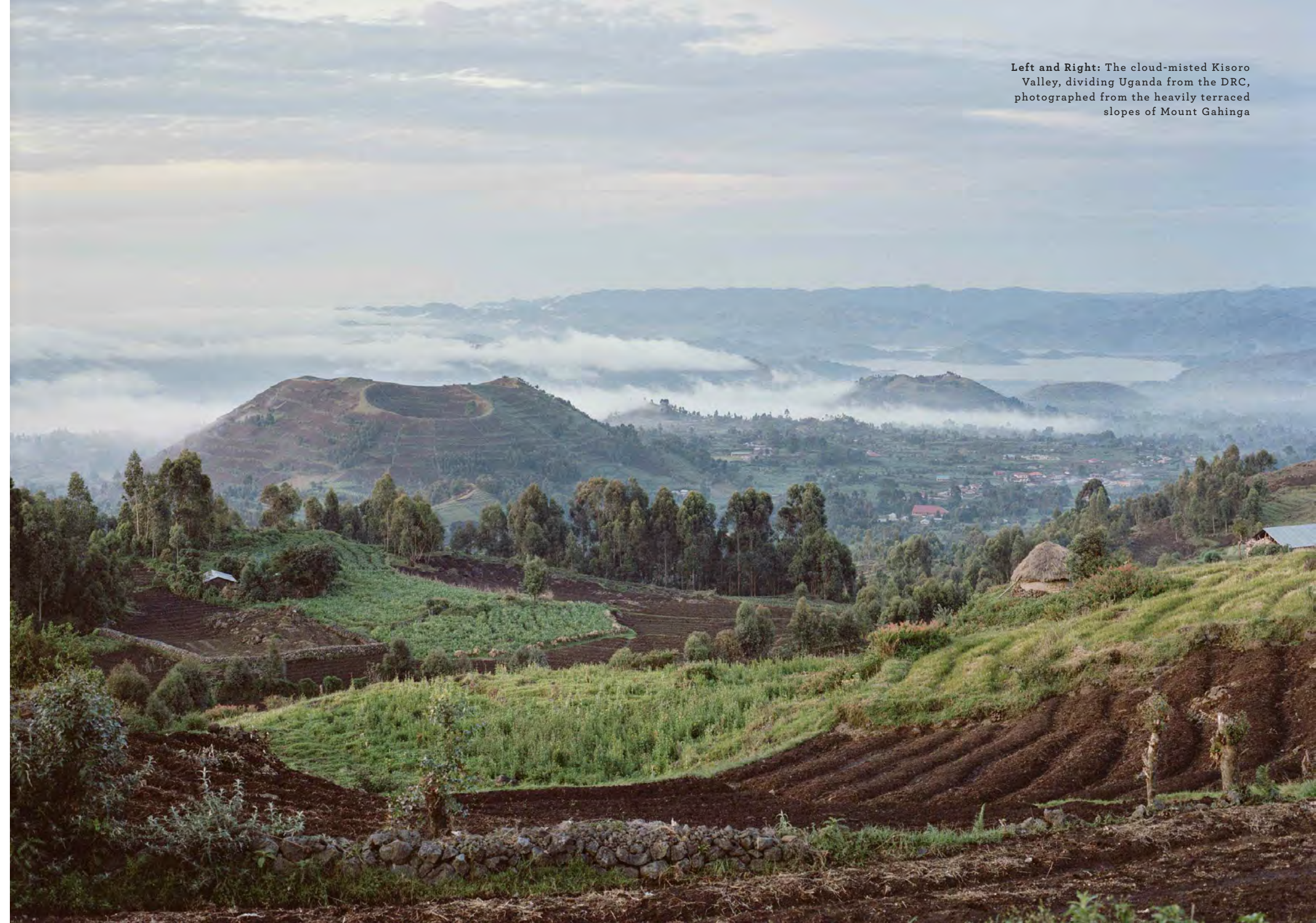
Left and Right: The cloud-misted Kisoro Valley, dividing Uganda from the DRC, photographed from the heavily terraced slopes of Mount Gahinga

That summer I tried to fly out to Rwanda to do voluntary relief work. It didn't work out. In 1995, I travelled to the Ugandan side of the Virungas for the first time since childhood. It was both magical and anguishing. This is when I recognised I couldn't not work in this part of the world. Although I had an ambiguous connection to Africa given what had happened to my family, I also had a strong empathy with what people had gone through; my mother's family had lived through the partition of India.