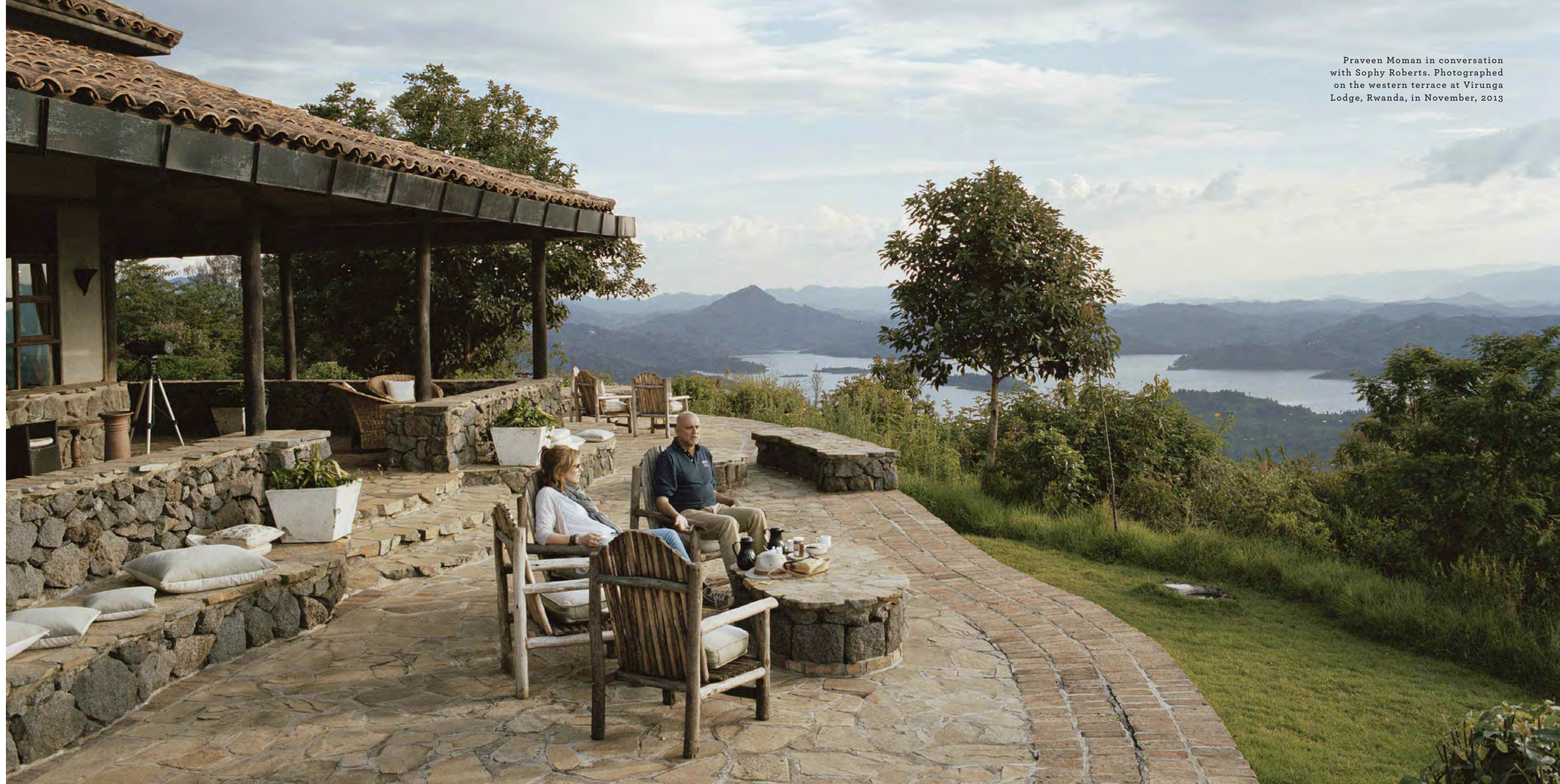
Praveen Moman in conversation with Sophy Roberts. Photographed on the western terrace at Virunga Lodge, Rwanda, in November, 2013