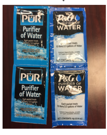
Figure 3: P&G Water Purification System

The CSDW program was established somewhat serendipitously after the failure of P&G's effort to create a market for its water purification sachets or packets (see Figure 3). P&G's leadership realized that the value of the product line as a nonprofit exceeded its value if run like other for-profit P&G brands. Besides P&G's genuine excitement to help treat billions of liters of water for people in need, the P&G leadership hoped that the program would help P&G gain an understanding of the market, build brand awareness, and finally help retain and attract top talent. To understand the value of the CSDW program both for the local community and P&G, it is important to understand how the program was established, the motivations of P&G as well as