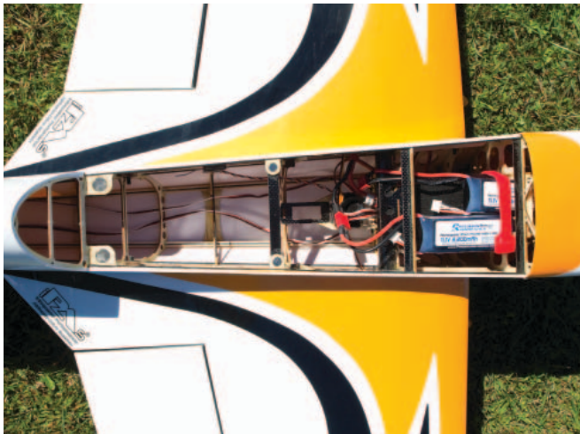
The KMX offers ample room to accommodate your electronics. One of the two batteries is located as far forward as possible to achieve the perfect center of gravity.