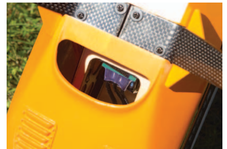
The lower cowl has a large cooling exhaust opening and the gear is strong enough to handle the toughest landings and runway surfaces.

Though you might think that vortex generators (VG) are just another neat bit of "bling" to add to your airplane for increased eye appeal, the carbon-fiber CNC cut VG accessory packages from Precision Aerobatics are indeed worth the effort of installing them on your Katana, or any other PA aircraft. The Katana MX vortex generators ($17.95) are easy to install in pre-cut slots in the wing leading edges and the wingtips. Once glued into place, the smaller VG tabs and the end plates help delay flow separation and aerodynamic stalling, helping improve wing efficiency. The VGs greatly improve flight characteristics at high angles-of-attack (AoA) and improve stability during 3D and knife-edge flight—especially at slow speeds. So, in addition to adding a cool, funky look to your plane, the VG package also makes your airplane a great performer both upright and upside down. By re-energizing the boundary layer, the wing just keeps on hanging in there. The benefit is that you can fly at four to five degrees more in AoA, and the wing continues to produce lift. With the increase in efficiency, your ailerons will remain effective and you can actually feel the difference.