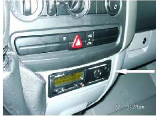
Second radio compartment