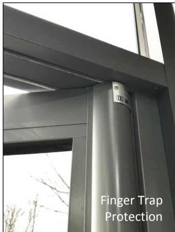
Finger Trap Protection