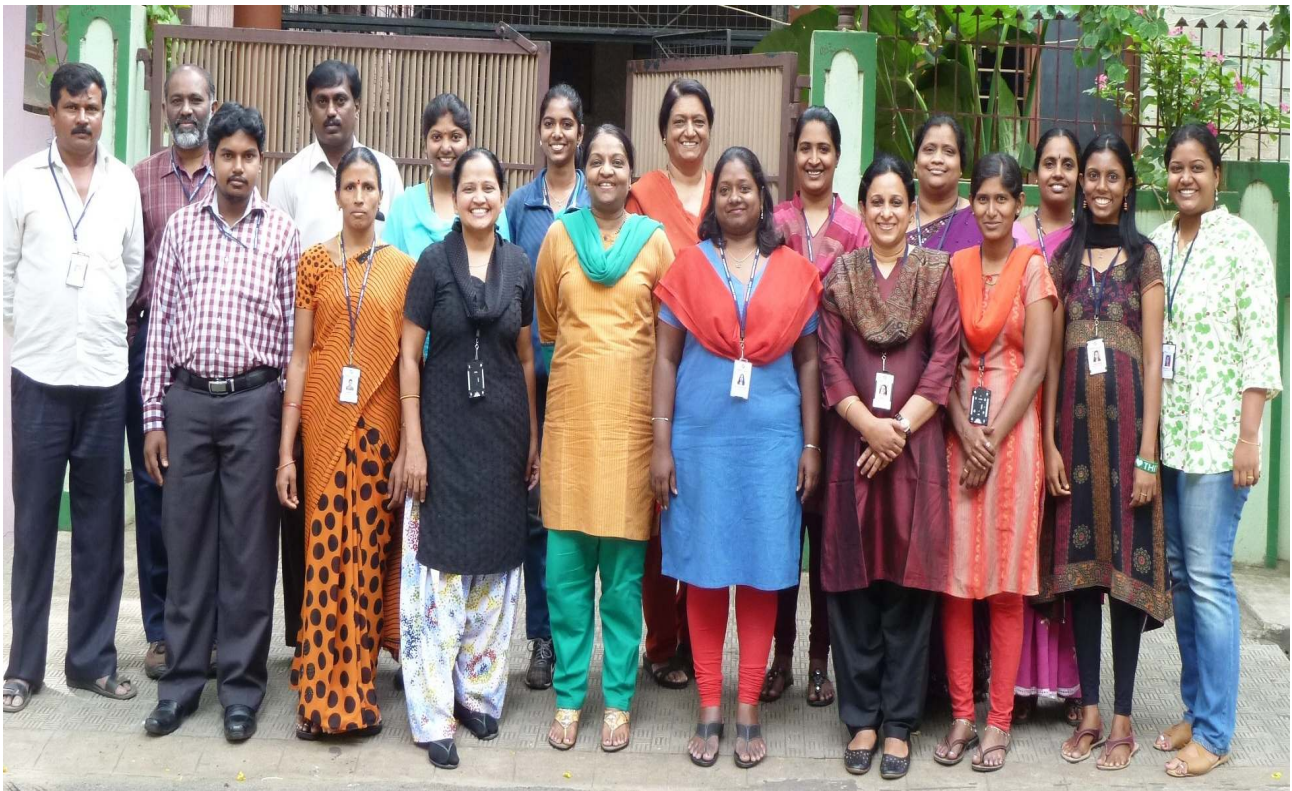
The ASHA Foundation team