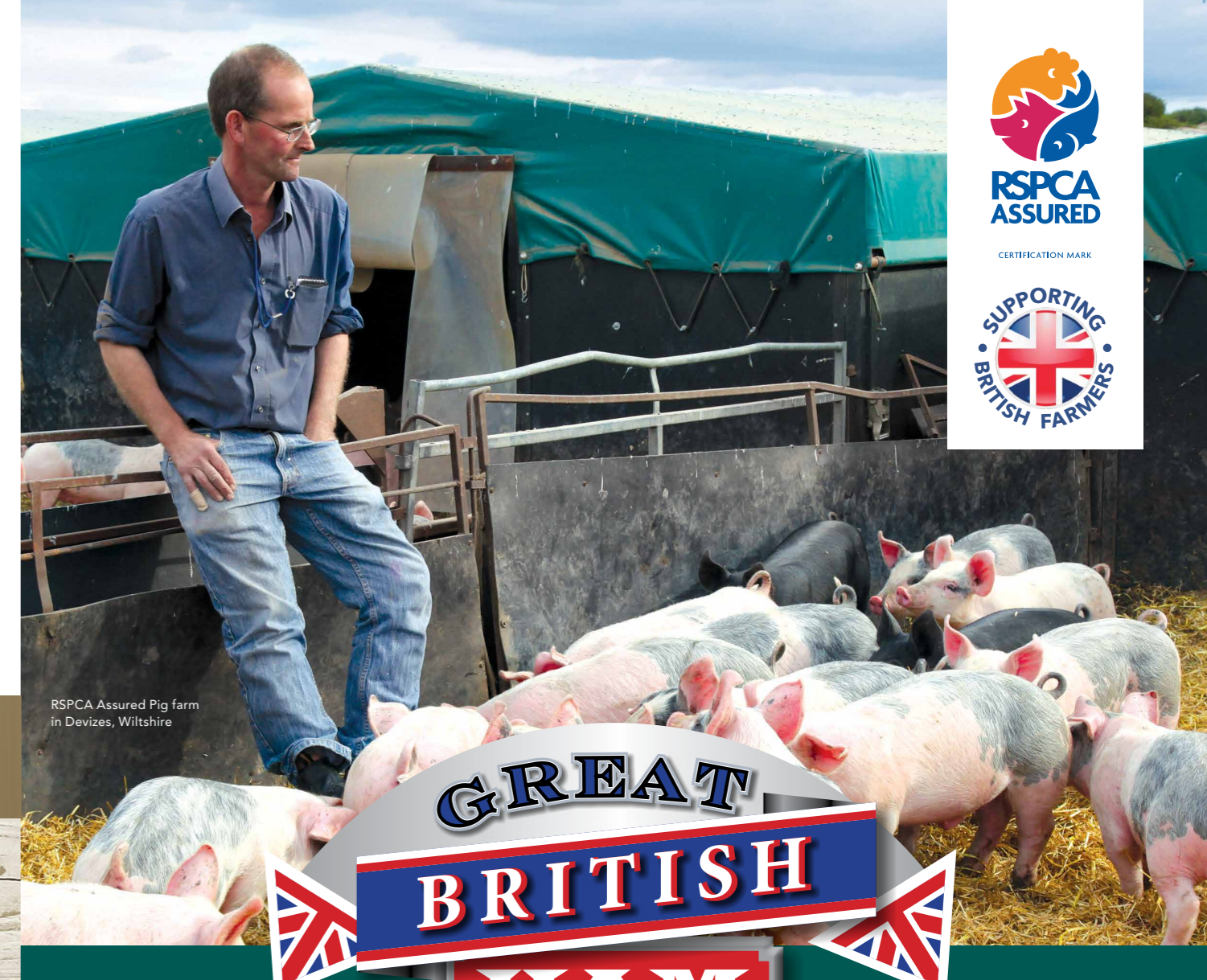
RSPCA Assured Pig farm in Devizes, Wiltshire