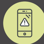
PARKING VIOLATION ALERTS