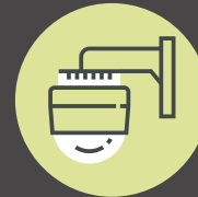
PARKING SOLUTION & SECURITY USING CAMERAS