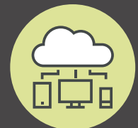
CLOUD BASED SERVICE & INTEGRATION API