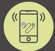
NAVIGATION TO LOT / GARAGE