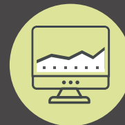
PARKING INTELLIGENCE DASHBOARD