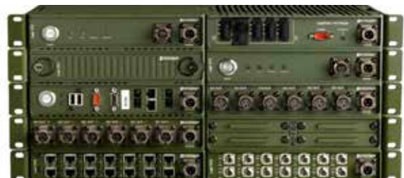
The possibilities are endless