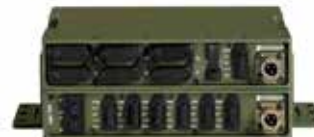
Two or more modules can be stacked on top of each other