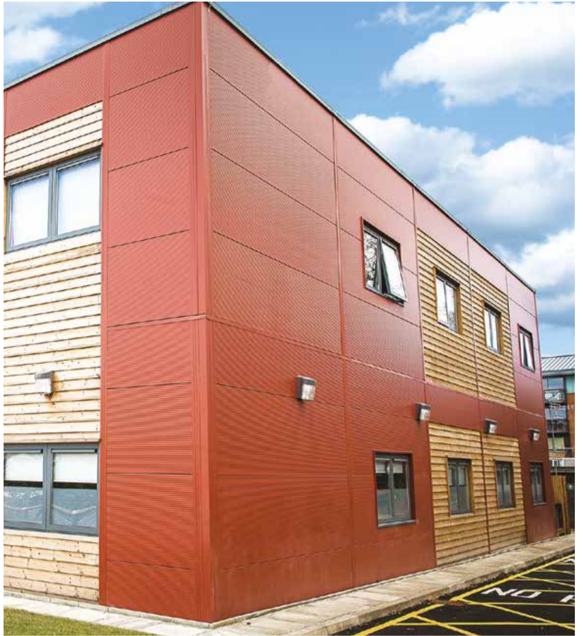
West Middlesex Maternity Unit is a current facility on long term hire with MCH.

In the public sector there is often a requirement for funding solutions to be classified as being 'off balance sheet'. MCH's knowledge of accounting standards (including SSAP21, IFRS, GAAP, and IAS17), coupled with our experience in consulting with public sector auditors, ensures that we are able to consistently structure solutions which meet the relevant accounting requirements.