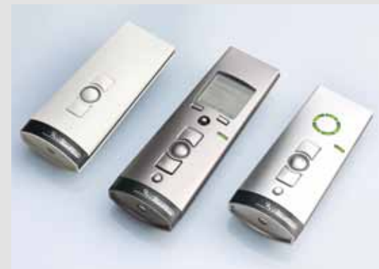
Remote controls Silent Gliss 9940