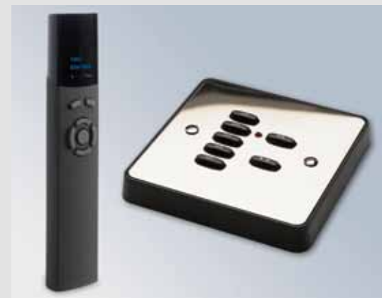
Remote controls Silent Gliss 0450

Our Customer Services team will be on hand from the start to offer expert advice on the most appropriate systems, control combinations and wiring for your project.