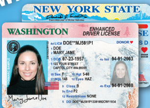
Enhanced Driver's License