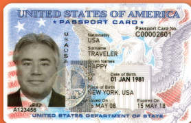
U.S. Passport Card