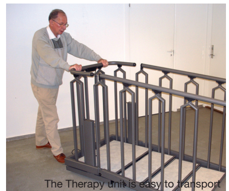
The Therapy unit is easy to transport