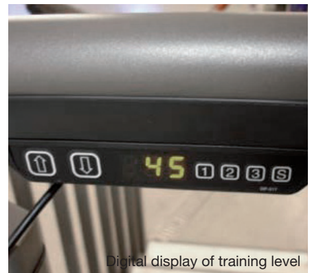
Digital display of training level