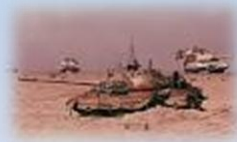
Desert Storm used a 4381