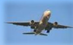
Jets use IMS