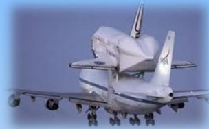
NASA used mainframes