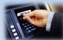
ATMs use CICS