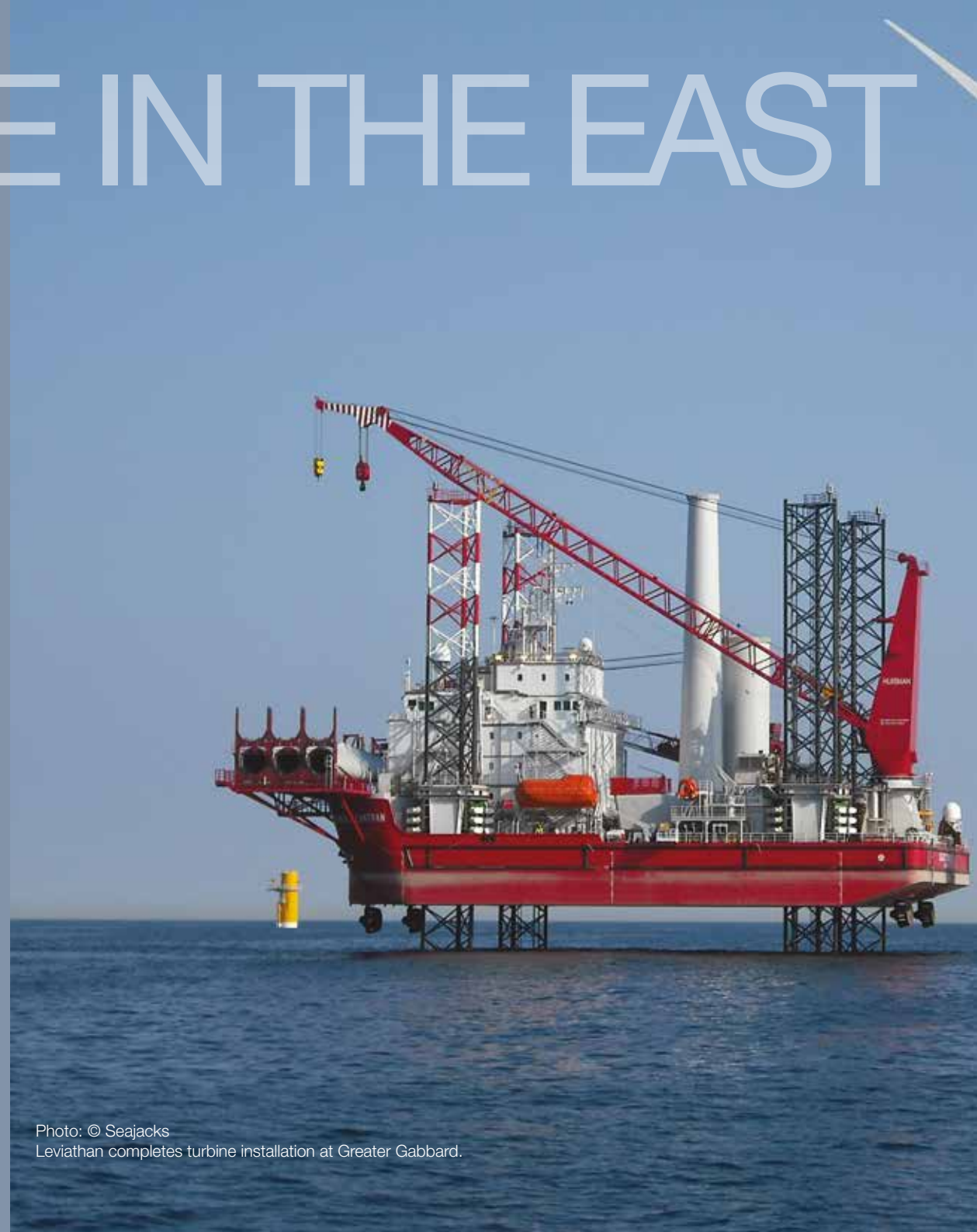
Seajacks Leviathan completes turbine installation at Greater Gabbard.

At the very heart of this, is OrbisEnergy.