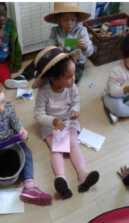
Look! Invitations have arrived!