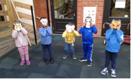
Learn and re-play the whole story