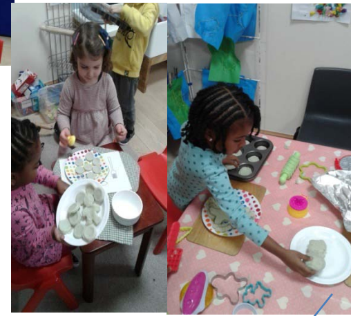
We prepare for a great big party!

How does the Focus Book inform our planning?