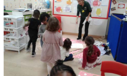
Measure, navigate, use new tools, predict, share, get messy

How does the Focus Book inform our planning?