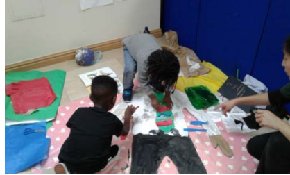
Plan and collaborate junk modelling on a very 'giant' scale