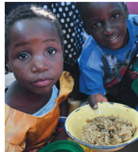
Over 400,000 young people regularly receive food through our partners around the world.

As we feed the body with food through schools, the mind is also being fed, opening a door to a better tomorrow.