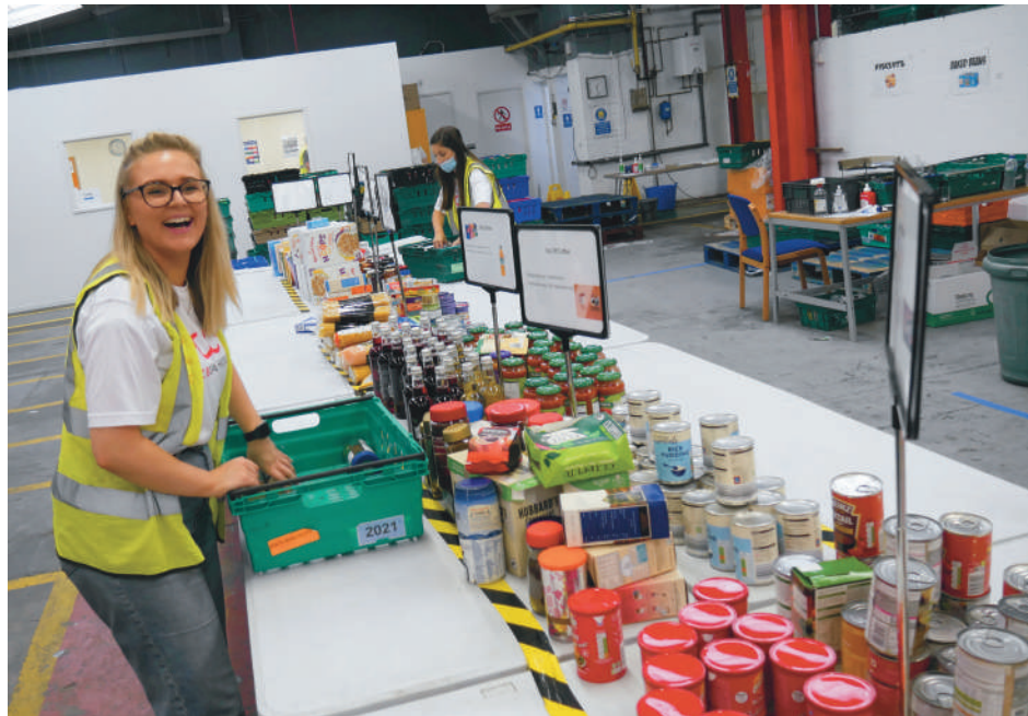
Volunteer teams come to The Halo Centre to sort and pack food for both the UK and internationally.

Through The Halo Centre, we are striving to bring transformation to local communities and offer a holistic approach to support, beyond providing food. We have developed a partnership with the Coventry Adult Education Service, and through this we are working together to provide training opportunities for local people in Coventry who find themselves struggling to put food on the table. By