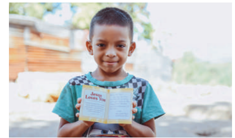
In December 2021, the young people who receive food provided by Feed The Hungry were also given a Christmas card sharing God’s love.