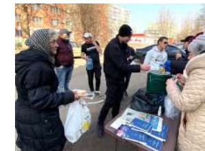
16 Ukraine Relief Update