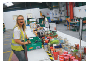
11 The Halo Centre: One Year On

By feeding the hungry together, and delivering it in the name of Christ, you are joining with Feed The Hungry to help change people's lives for the better, for the future and for eternity.