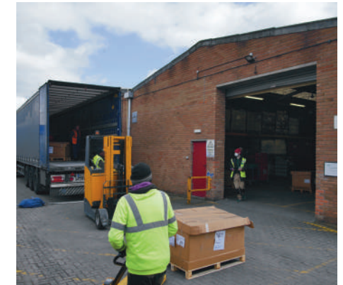
Containers are sent from The Halo Centre to our international partners around the world.

events has already been sent out to Lebanon. Through a partnership with Coventry City Council, we have also been able to operate three large scale packing events to provide food hampers to local children facing holiday hunger at Easter, Summer and Christmas.