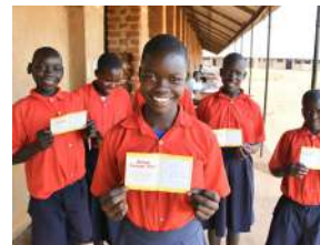
4 Feeding the Future