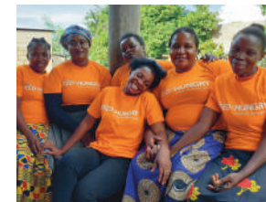
6 Discovering Zambia