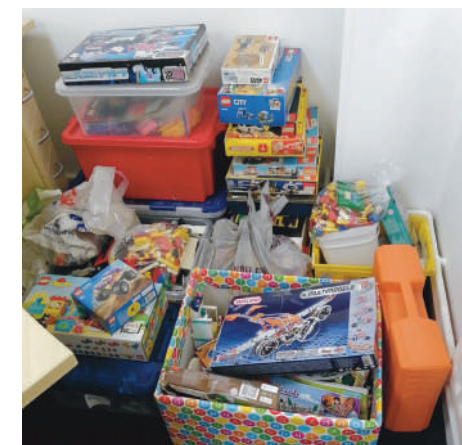
Over 100kg of construction toys were collected and sent to Romania in time for Christmas.

As the team left Bread of Life, the young people wanted to know when they were coming back again. It's our hope to return again in 2022, to encourage learning through playing with the construction toys and to continue sharing the love and fullness of life in Christ with the young people at Bread of Life.