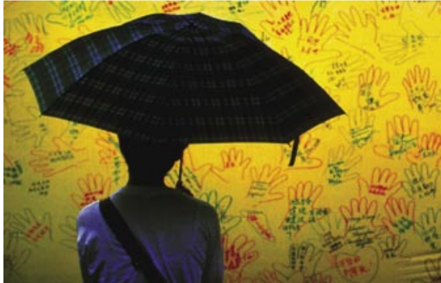
Reading a protest banner in Hong Kong.

“One of the best ways to show these mega-shifts is through features that tell, engagingly, of individuals’ experiences.”