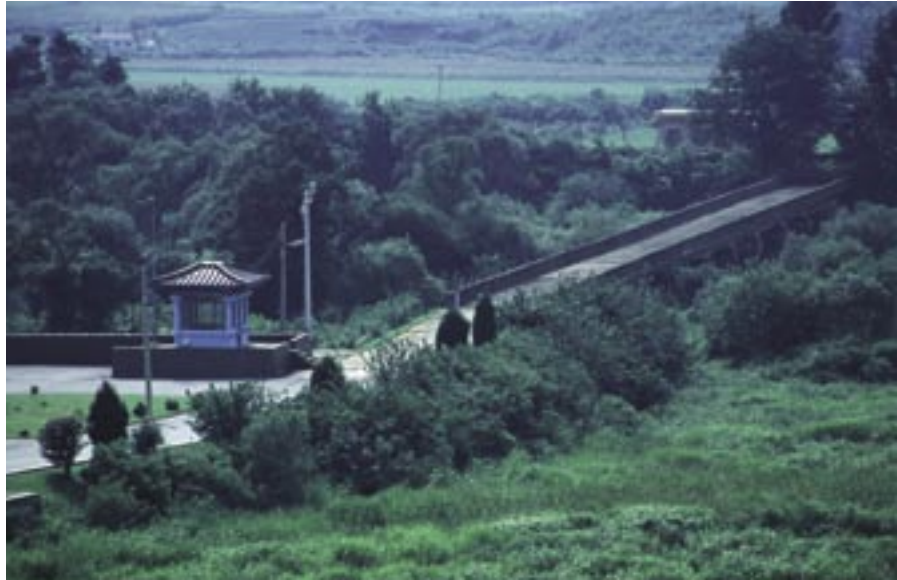
The Bridge of No Return between North and South Korea.

Ploughshares Fund support is enabling Walsh to bring North Korean diplomats to- gether with members of Congress...in most cases for the first time.