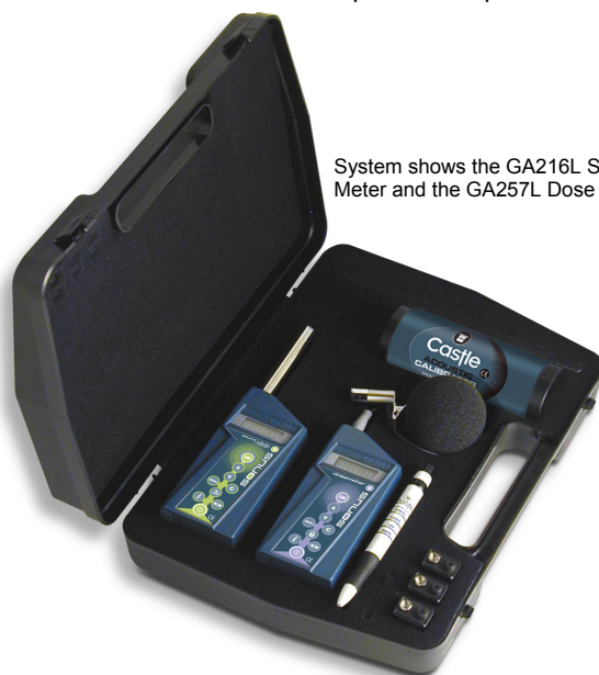
System shows the GA216L Sound Meter and the GA257L Dose meter