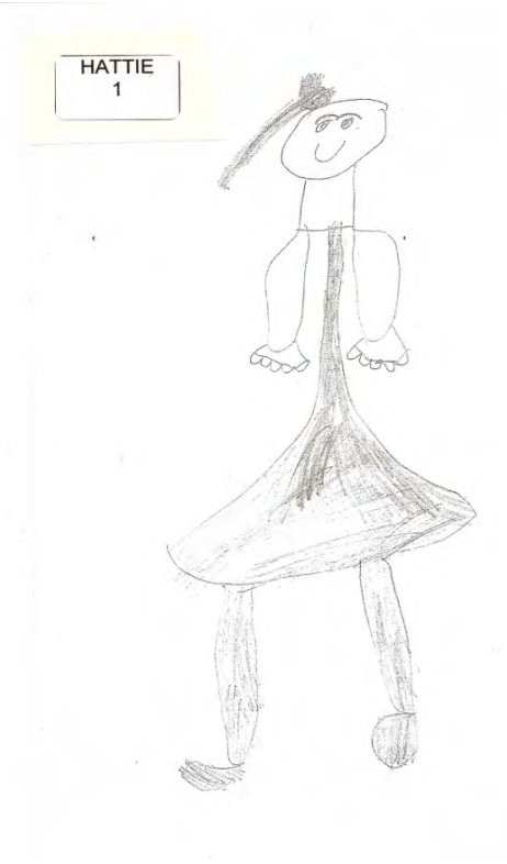
Figure 28a: (pre)