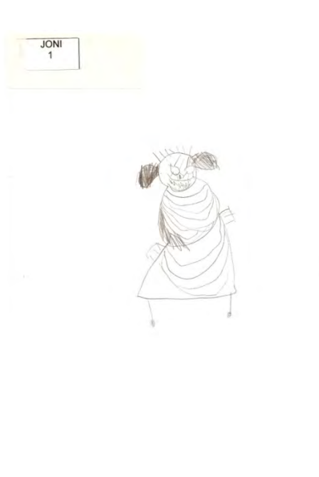
Figure 29a: (pre)