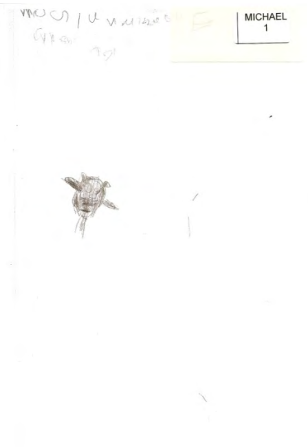
Figure 30a: (pre)