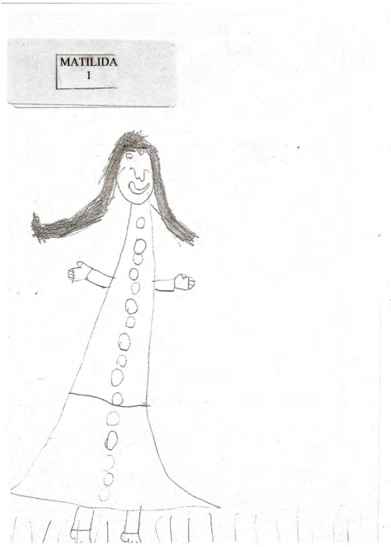
Figure 33a (pre)