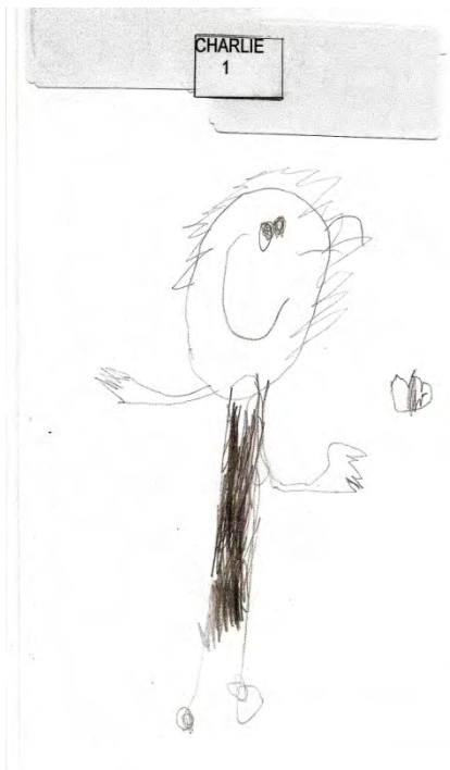
Figure 32a: (pre)