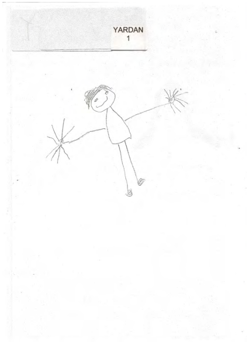
Figure 31a: (pre)