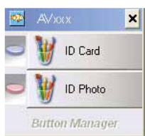
The Button Panel

1. After the Button Manager and the scanner driver have been successfully installed on your computer, the Button Panel will be displayed in the Windows System Tray at the bottom right corner of your computer screen.