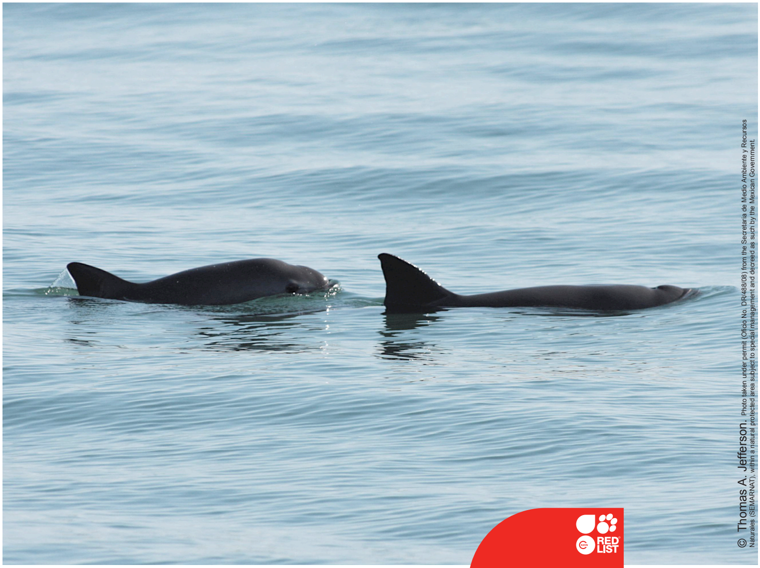
Photo taken under permit (Oficio No. DP/488/08) from the Secretaría de Medio Ambiente y Recursos Naturales (SEMARNAT), within a natural protected area subject to special management and decreed as such by the Mexican Government.