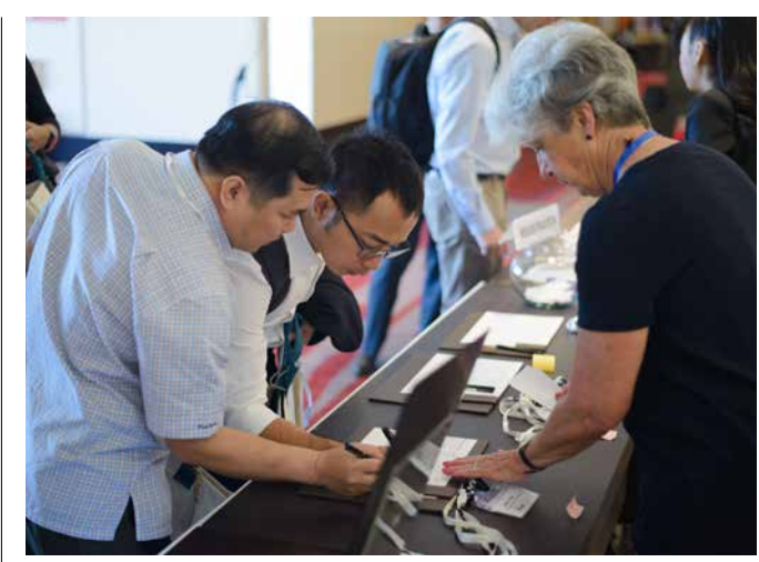
Smooth and efficient registration.

On many counts, this first Duck Meat Quality Conference that attracted more than 120 delegates from 14 countries and sponsored by Global Nutrition, GI-Ovo, CP Foods and Bangkok Ranch, was an immense success. Ap