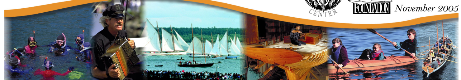
Tracking the progress of the Northwest Maritime Center facility & Wooden Boat Foundation programs