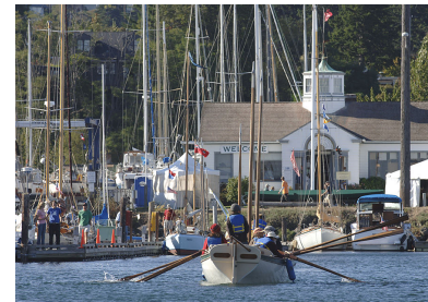
The Cupola House at Point Hudson has a new display in the lobby to showcase the future Northwest Maritime Center facility, the planned home for both of our organizations. Come visit!

The 29th annual Wooden Boat Festival capped a great summer of Northwest Maritime Center and Wooden Boat Foundation joint programming on Port Townsend Bay.