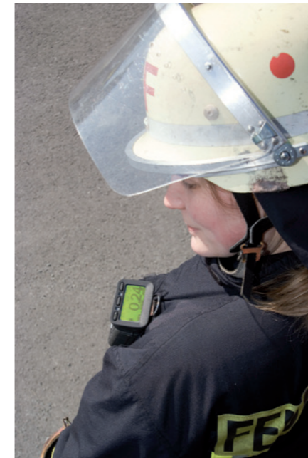
Reversible display always visible

tions, so working life and maintenance requirements are minimized. This gives the user far lower servicing and operating costs.