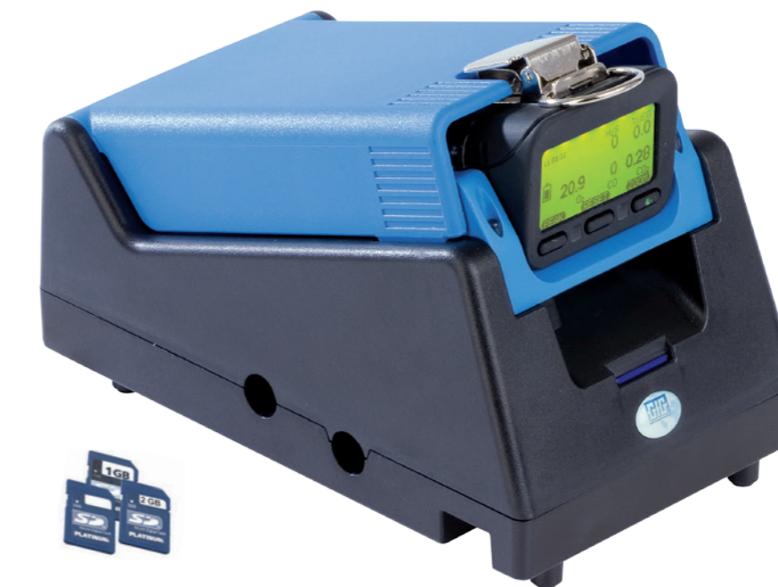
SD-cards: permanent data-logging for up to 45 years

Each channel (flammable, oxygen, toxic) has 3 programmable alarm values. In addition Occupational Exposure Limit (OEL), Time-Weighted Average (TWA) and Short-Term Exposure Limit (STEL) are auto-