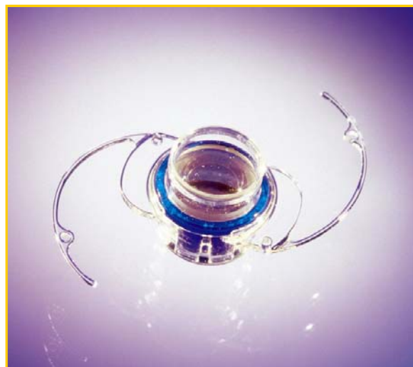
FIGURE 2: IMPLANTABLE MINIATURE TELESCOPE (by Dr. Isaac Lipshitz)

The intraocular telescope is intended to improve distance and near vision in people who have lost central vision in both eyes because of end-stage AMD . The intraocular telescope is about the size of a pea and is surgically placed inside one eye. The implanted eye provides central vision. The other eye provides peripheral vision . A picture of the intraocular telescope is shown in Figure 2.