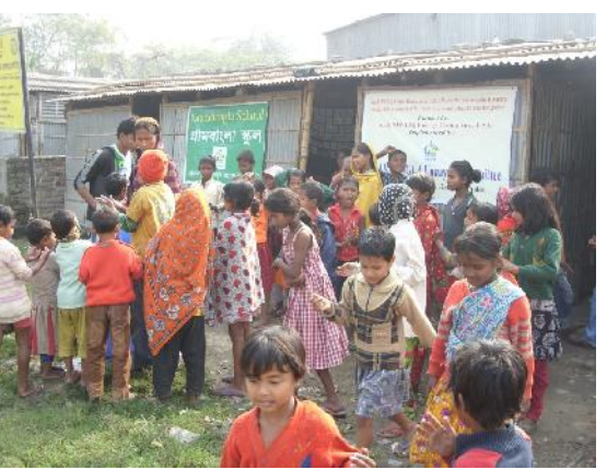
em[PAWER] Energy Group, Inc.