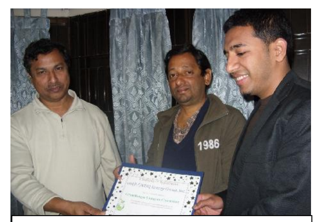
Certificate from em[POWER] USA to GUC on partnership and joint collaboration in wastepicking communities