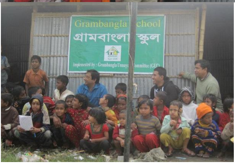
em[P_WER] Energy Group, Inc.