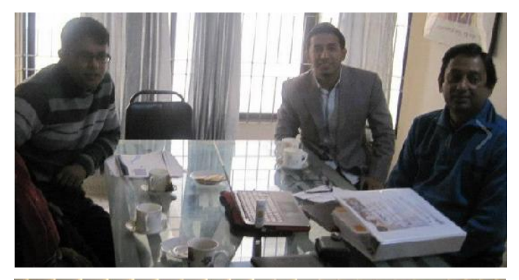
Meeting on future em[POWER] Clinic in the Matuail Landfill