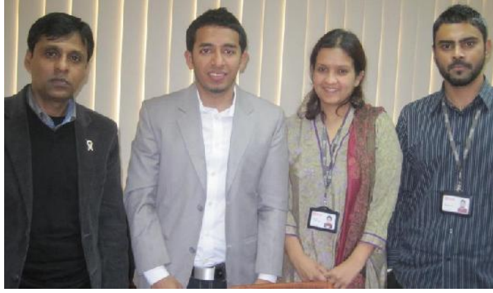
Meeting with BRAC NGO-Health Program Potential support for health segment