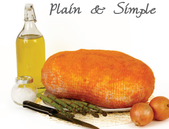
Covered in Crumbs