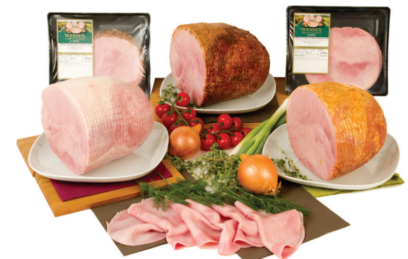
Portioning to your Requirements