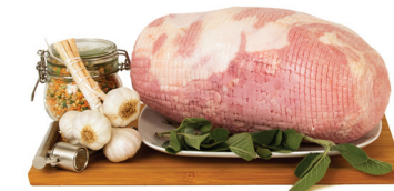
Plain & Simple