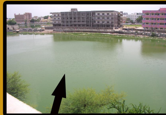
Lake before Aeration