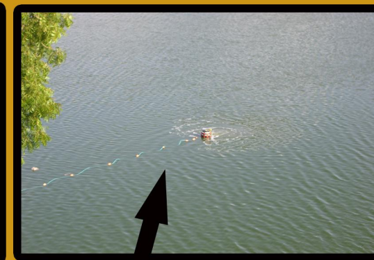
Lake after Aeration process