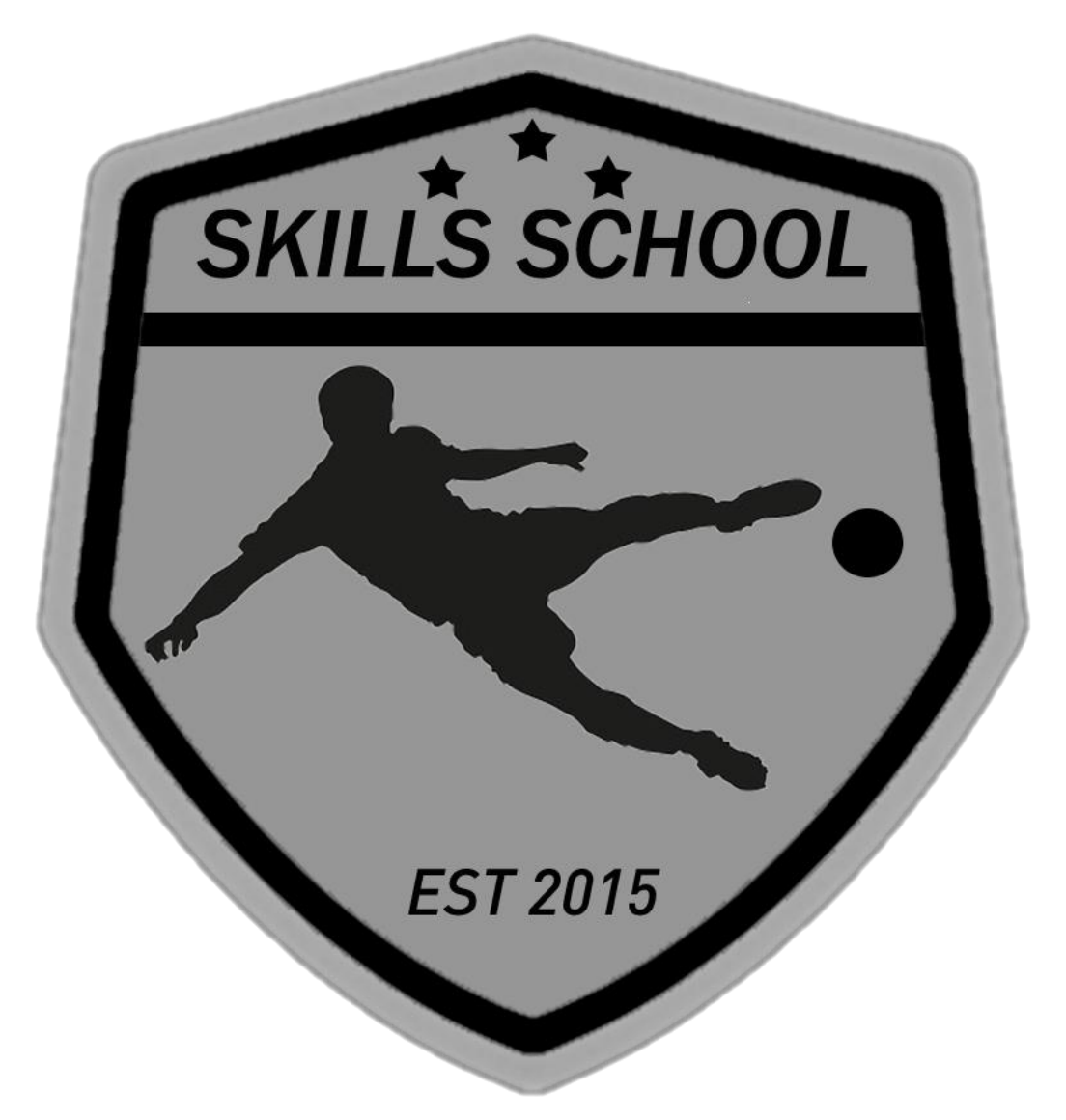
Skills School 2018/19 Season