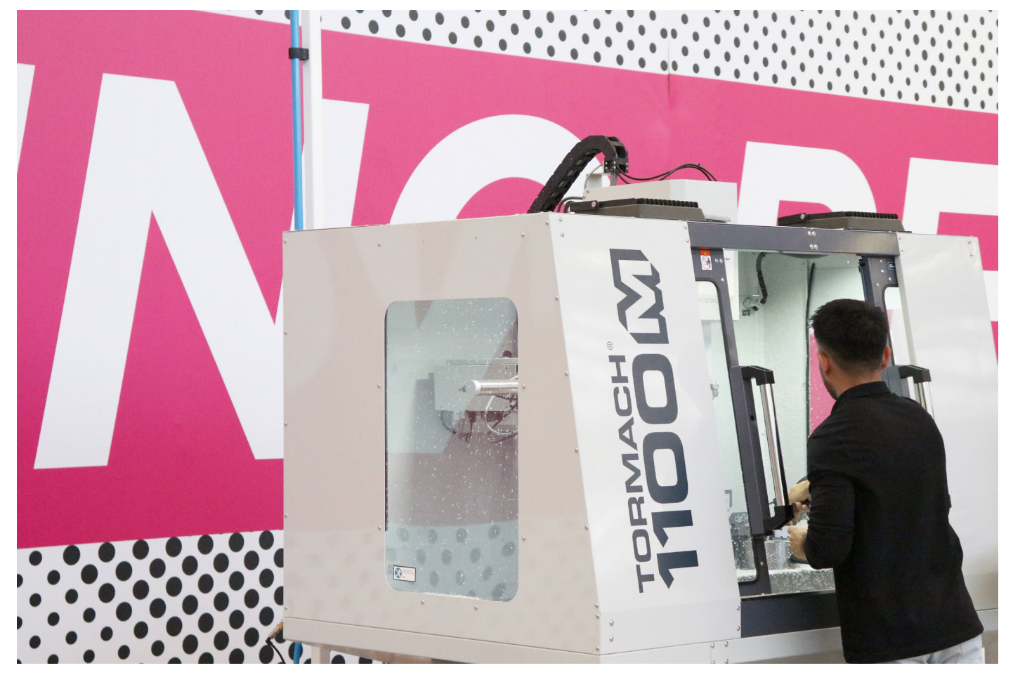
Anatomics Manufacturing Facilities, Bentleigh East, VIC.