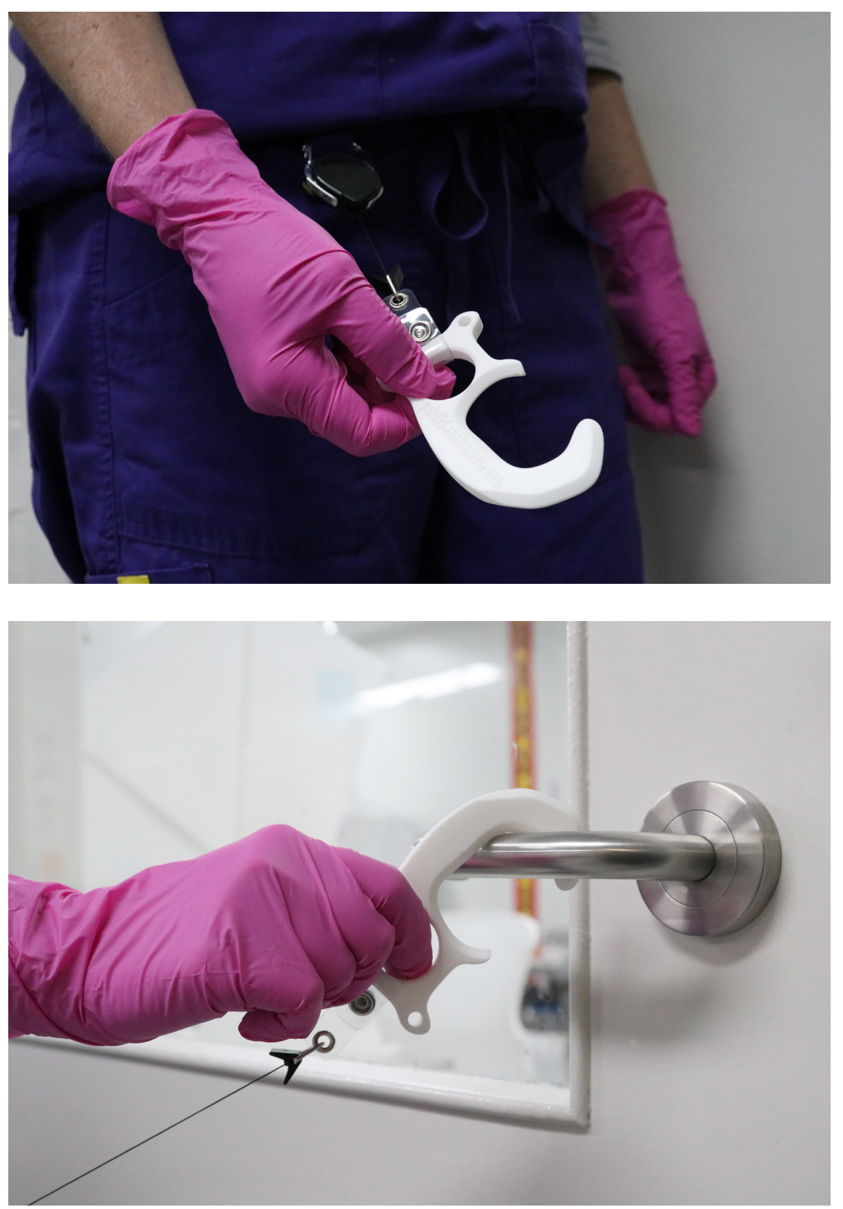
Anatomics Door-Opener, Prototype Sample Image.