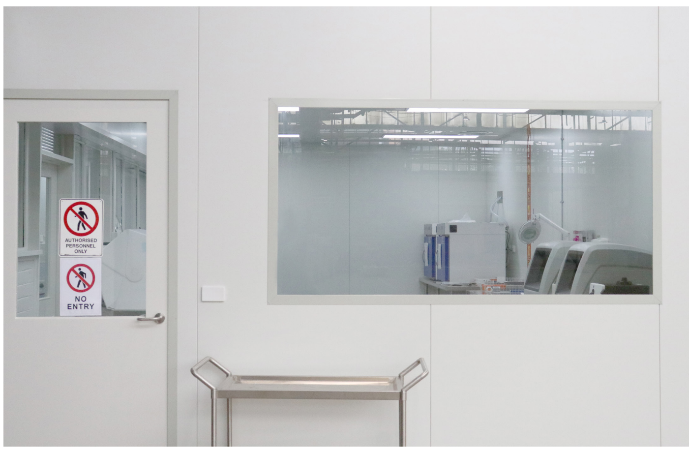
Anatomics Manufacturing Facilities, Bentleigh East, VIC.