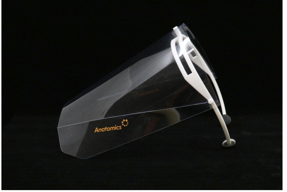
Anatomics Full-Face Shield, Prototype Sample Image.