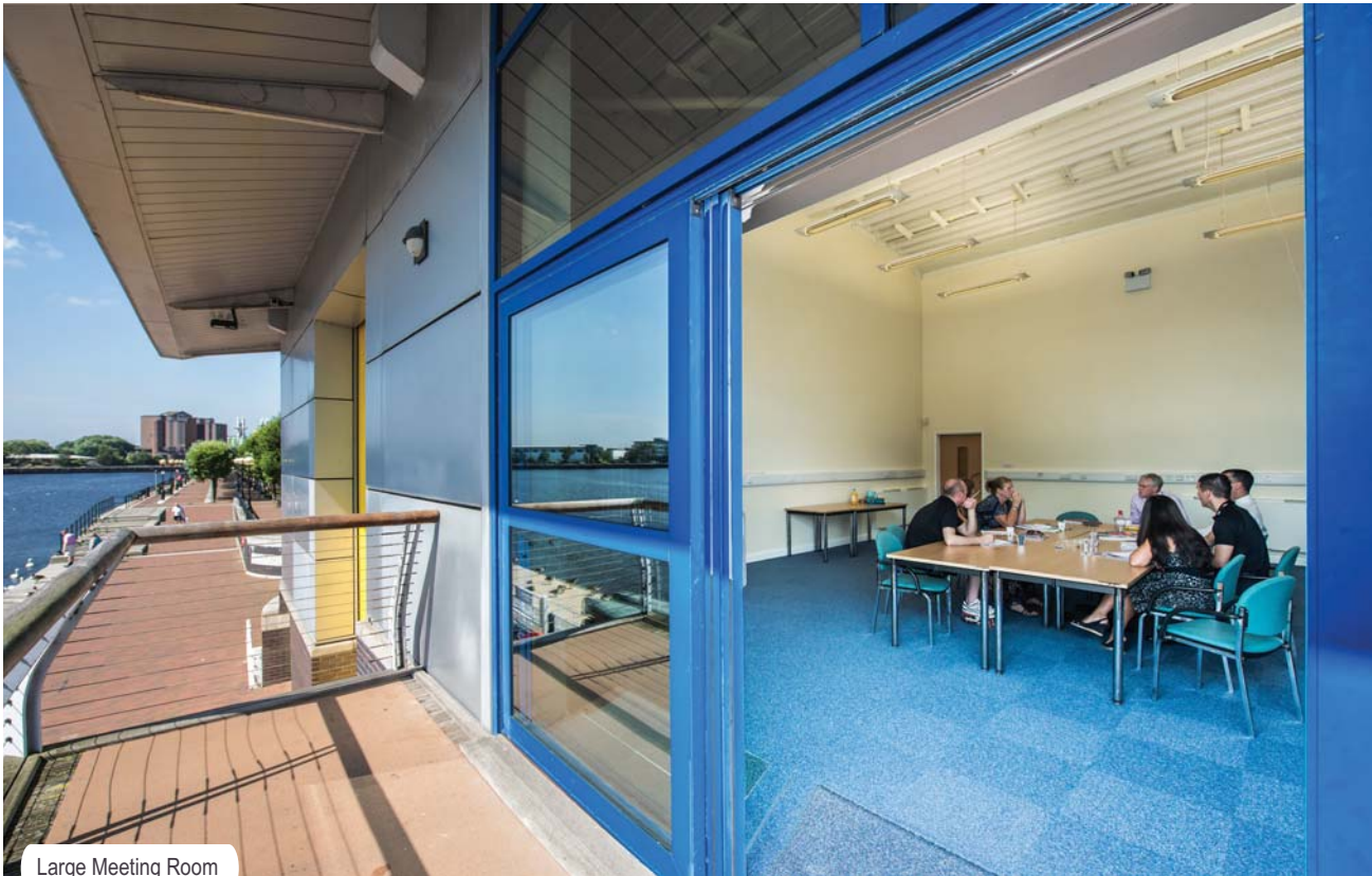
Large Meeting Room