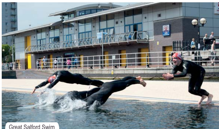
Great Salford Swim