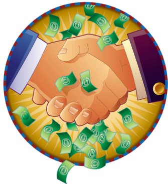
A customer paying a service provider