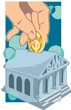
An employer or the government depositing money to a person's checking account