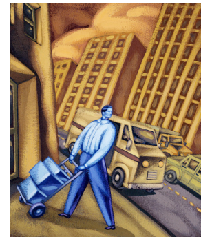
A business paying a supplier for products