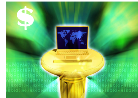
A taxpayer sending funds to the IRS or local organizations online