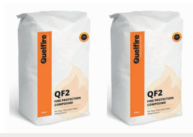
QF2 Fire Protection Compound

QF2 Fire Protection Compound is intended for use as a gap filling material where cables, ducts or pipework services penetrate fire compartment floors and walls. QF2 expands slightly on curing (1%), to form a rigid smoke and gas tight seal and is also suitable for use in load bearing situations. Subsequent to installation it will accept further services penetrating the barrier without damage.