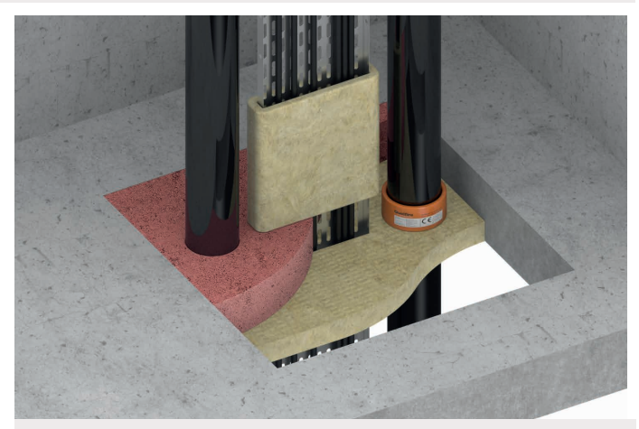
QF2 Fire Protection Compound used in conjunction with MW Mineral Wool Slab