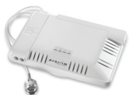
ORiNOCO® Public Safety Wi-Fi Mesh

802.11 a/b/g, 4.9GHz dual radio (FCC: Public Safety) 54Mbps