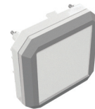
Tsunami® QB-62000 Series