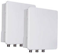
Tsunami® QB-8100 Series

High Capacity, License-free Point to Point Bridges from 11Mbps to Gigabit Speed