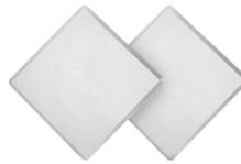
Tsunami® QB.11 Series