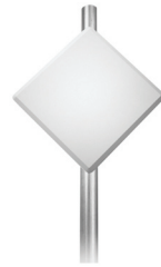
Tsunami® MP.11 Series