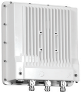
Tsunami® MP-8100 Series

High Speed Broadband Wireless Access for fixed and mobile applications