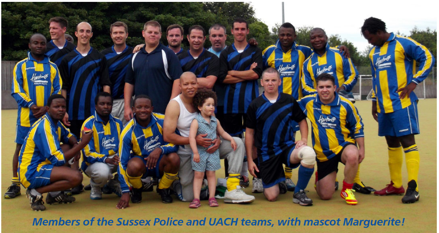
Members of the Sussex Police and UACH teams, with mascot Marguerite!

Building upon the existing positive relationship between the police and local community groups in Hastings, the United African Community Hastings (UACH) football team played against a team from Sussex Police on 27 July at Horntye sports complex to celebrate Africa Day 2013.