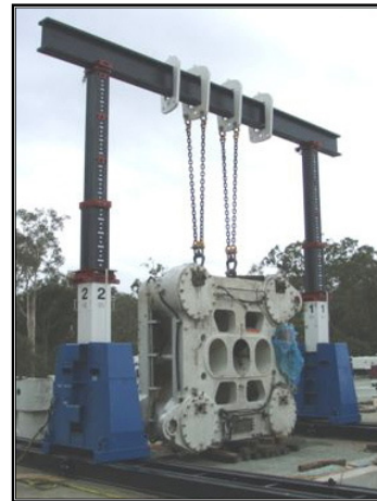
J&R L1001-2-34 LIFT-N-LOCK hydraulic boom gantry project in Brisbane, Australia.