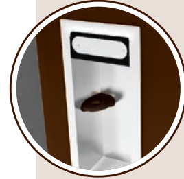
Single point latch