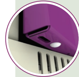
Quiet close feature