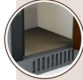
No rust bottoms