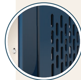
Punched for ventilation