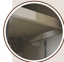
16 gauge galvanized shelves