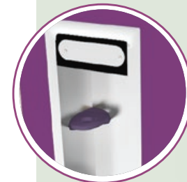
Single point latch