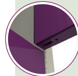
14 gauge door panel, 20 gauge liner