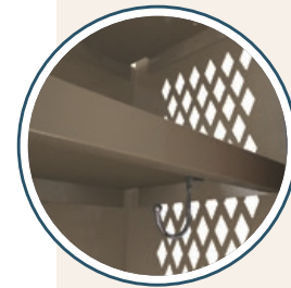
16 gauge galvanized coated