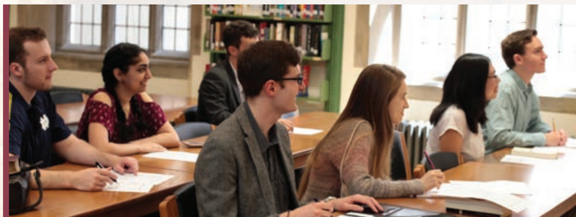
Students enjoying a class in the Aula at Blackfriars