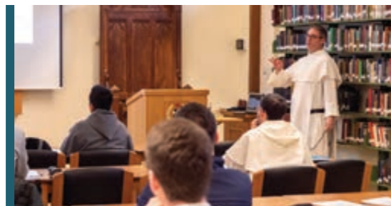
A class in the Aula

Students from our partner institutions receive credits equivalent to full-time study at their home university.