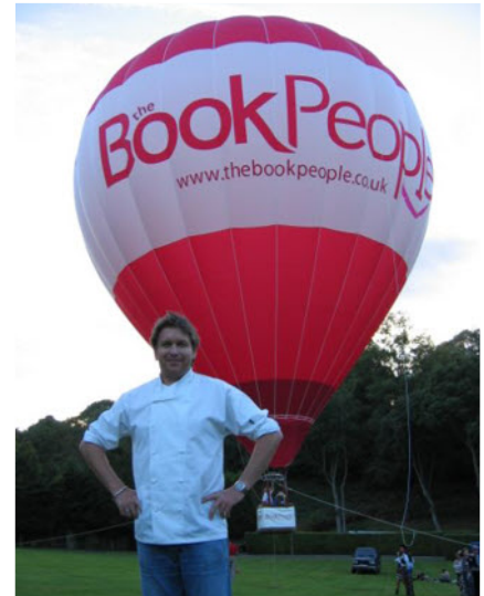
TV Chef James Martin Launches the Bookpeople Balloon

Tethered balloon flights and displays are available both day and night-time and we are able to offer anything from a single balloon to a complete balloon festival.